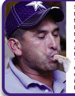
Students learn to distinguish hardwoods from softwoods and learn the characteristics of common crosstie species such as color, grain pattern, and porosity. The porosity of red oak is illustrated by dipping a small piece in soapy water and blowing bubbles!