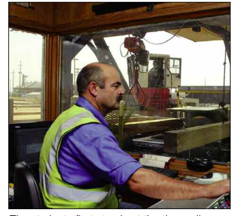
The students first stop is at the tie grading station where they get to see first-hand what the tie graders see.