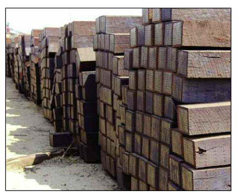
Stacks of treated ties at the Koppers plant.