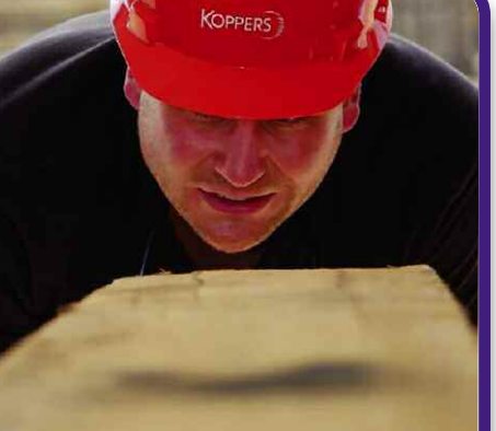
Students take the final test individually. Again they have to identify grade and species.