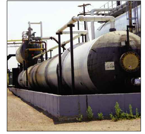
The treating cylinder, treated ties and the end plating station are highlights of the tour.