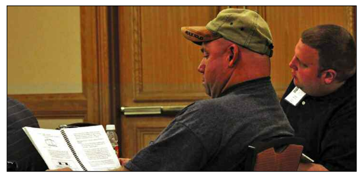
Students learn the history of how railroads have developed requirements to minimize early failures in ties and optimize the life cycle costs of pressure-treated wood ties.