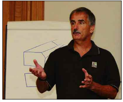
Watt and Morrell tag team the subject of wood preservation, quality control and treatability of species.