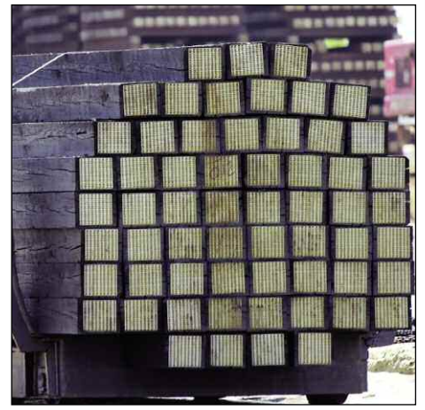
Then, it's back to the Koppers plant where students get a tour of the treating facilities.