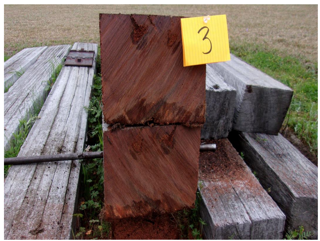
A66 - Tie #3 (Turada).