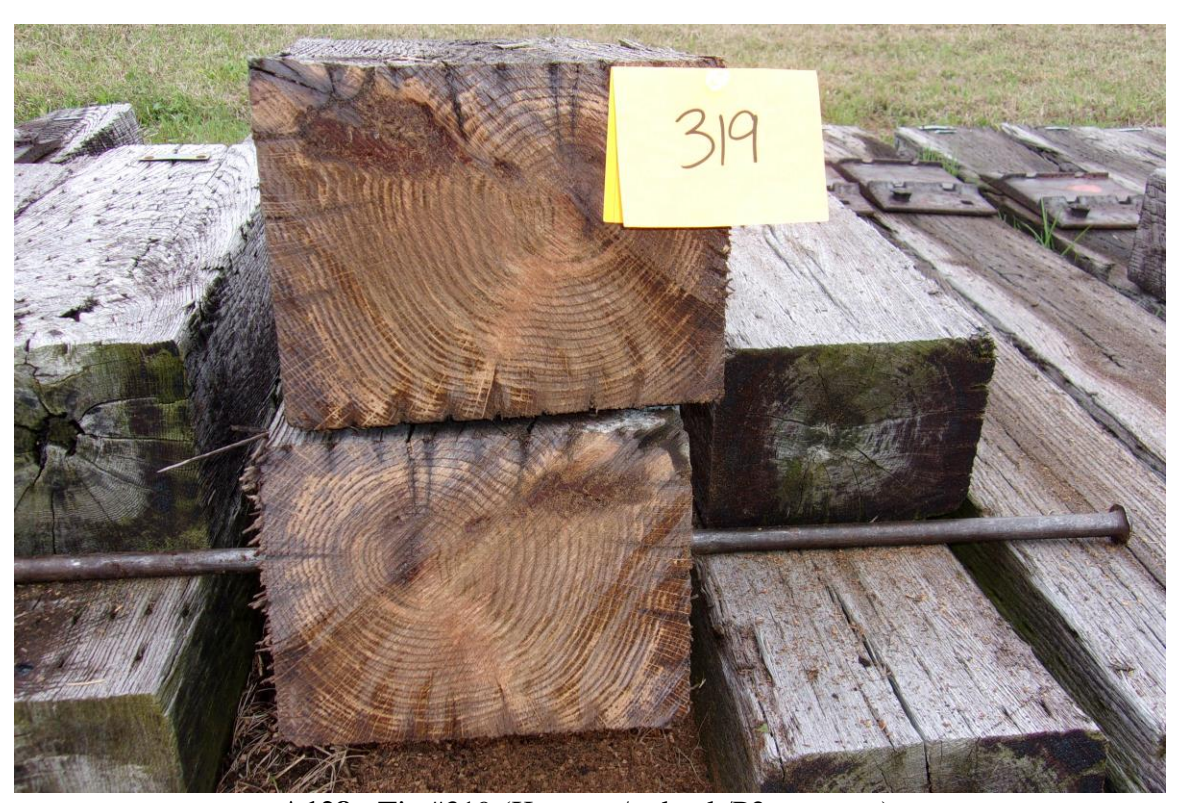
A128 - Tie #319 (Koppers/red oak/P2 creosote).