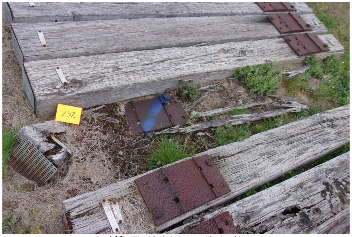
A98 - Tie #252 (untreated/red oak).