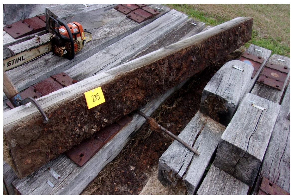
A113 - Tie #235 (Merichem/white oak/CuNap) with trace decay & termite damage.