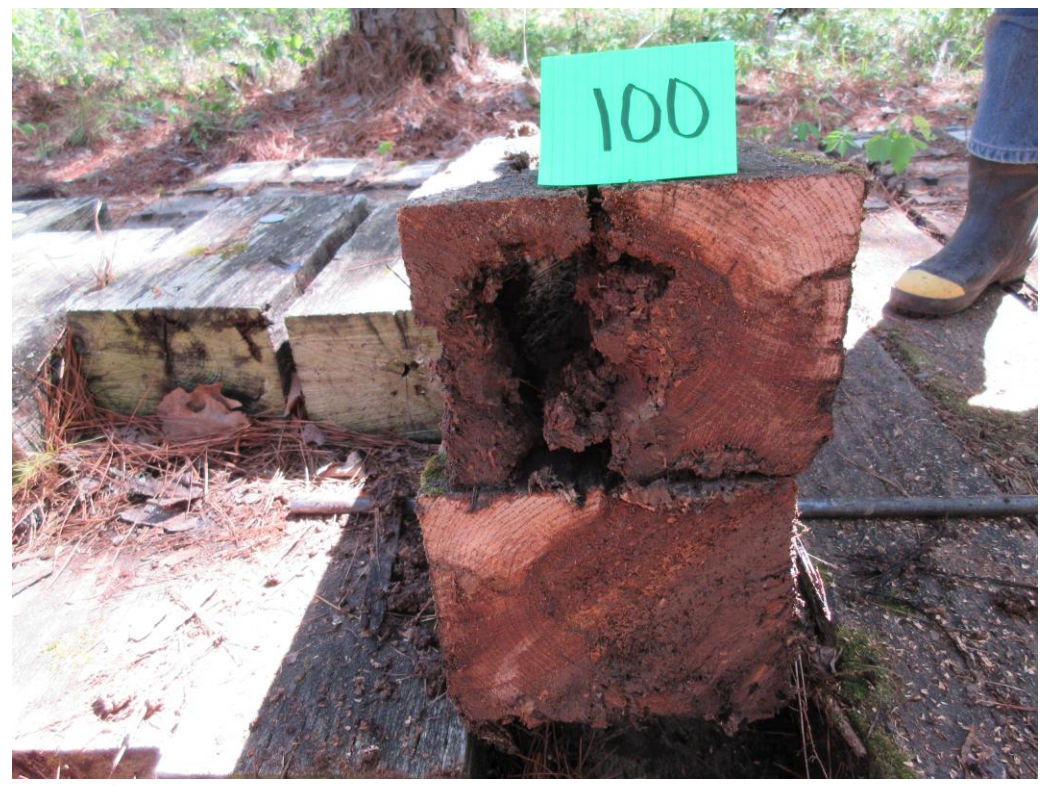
A20 – Tie #100 (Lonza/red oak) significant internal deterioration.