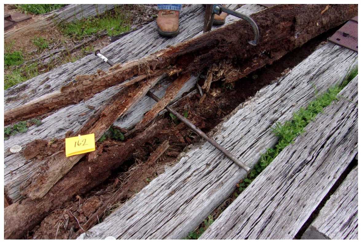
A101 - Tie #162 (Nisus/white oak/boron) failed due to decay.