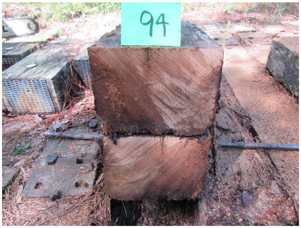
A18 - Tie #94 (Lonza/white oak).