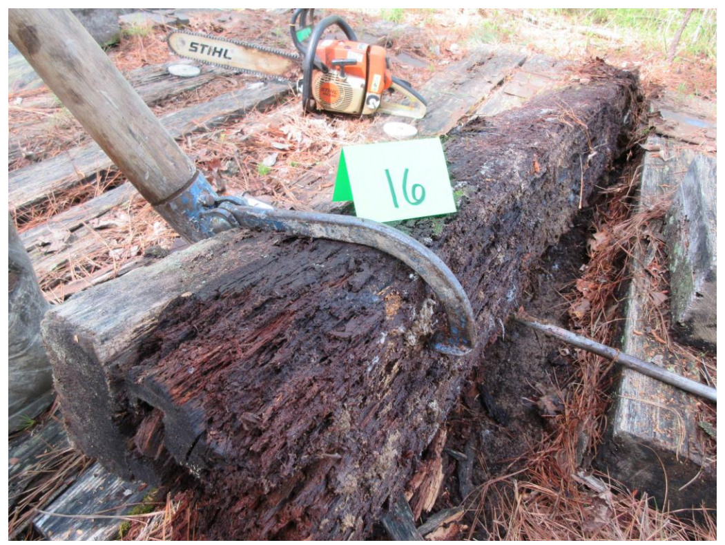
A3 – Tie #16 (Cedarcide/red oak) with extensive decay.