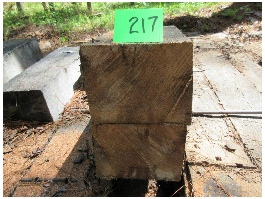
A44 - Tie #217 (Merichem/red oak/borate/CuNap).