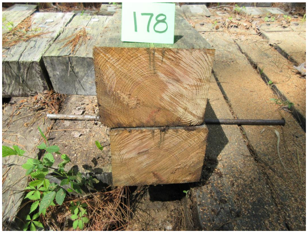
A36 - Tie #178 (Nisus/red oak/borate/oil B).