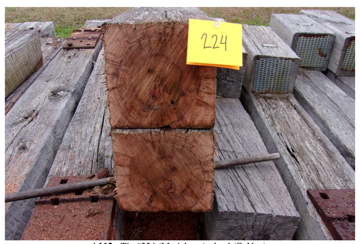
A112 - Tie #224 (Merichem/red oak/CuNap).