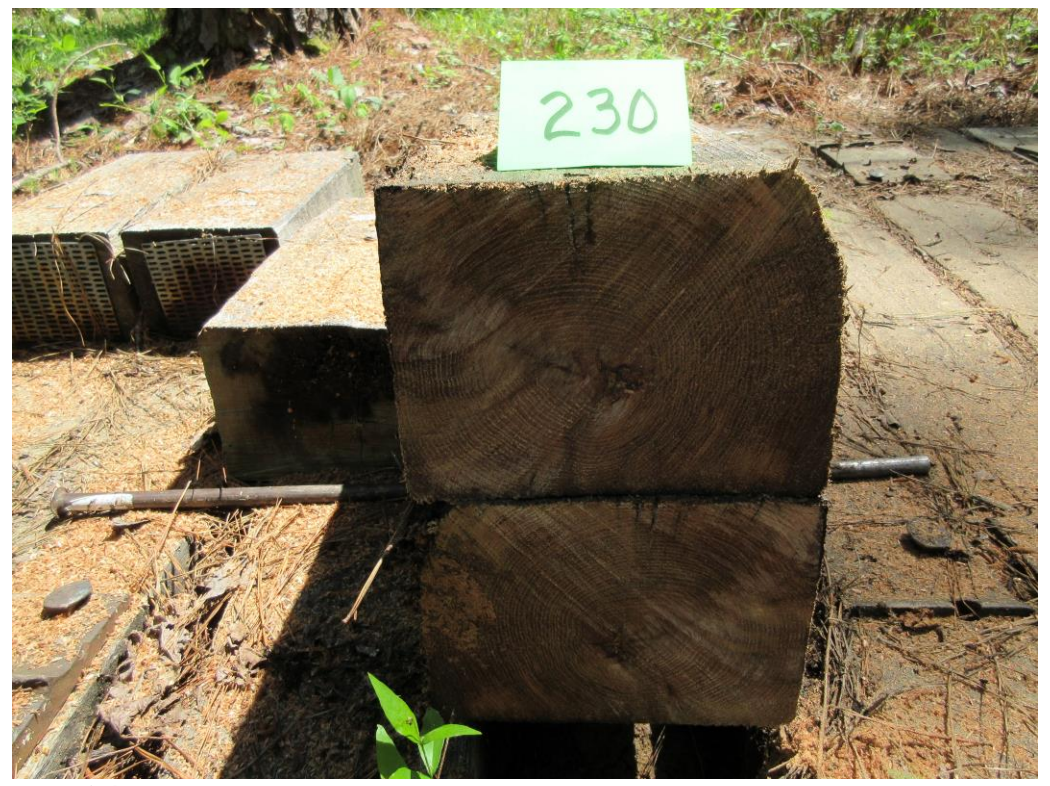
A48 - Tie #230 (Merichem/red oak/CuNap) with light internal decay.