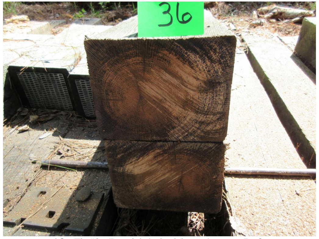
A8 – Tie #36 (Boatright/red oak/borate/creosote 7pcf).