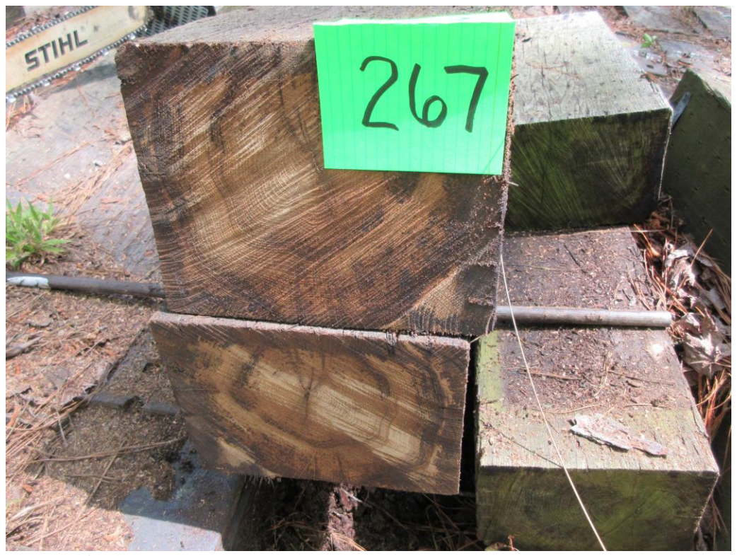
A54 - Tie #267 (Koppers/red oak/creosote petroleum solution).