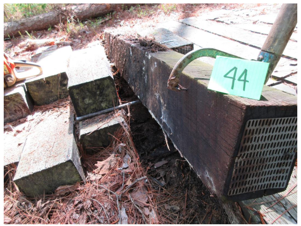
A15 - Tie #44 (Boatright/white oak/creosote to refusal).