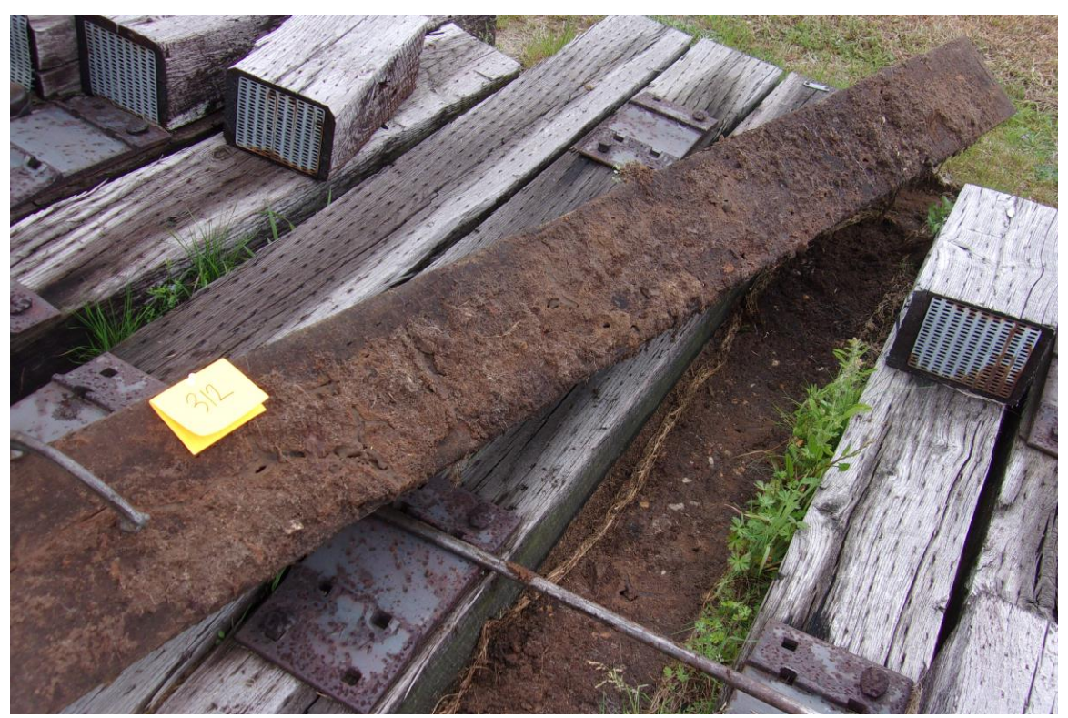
A125 - Tie #312 (Koppers/white oak/creosote petroleum solution) with light decay & Formosan termite damage.