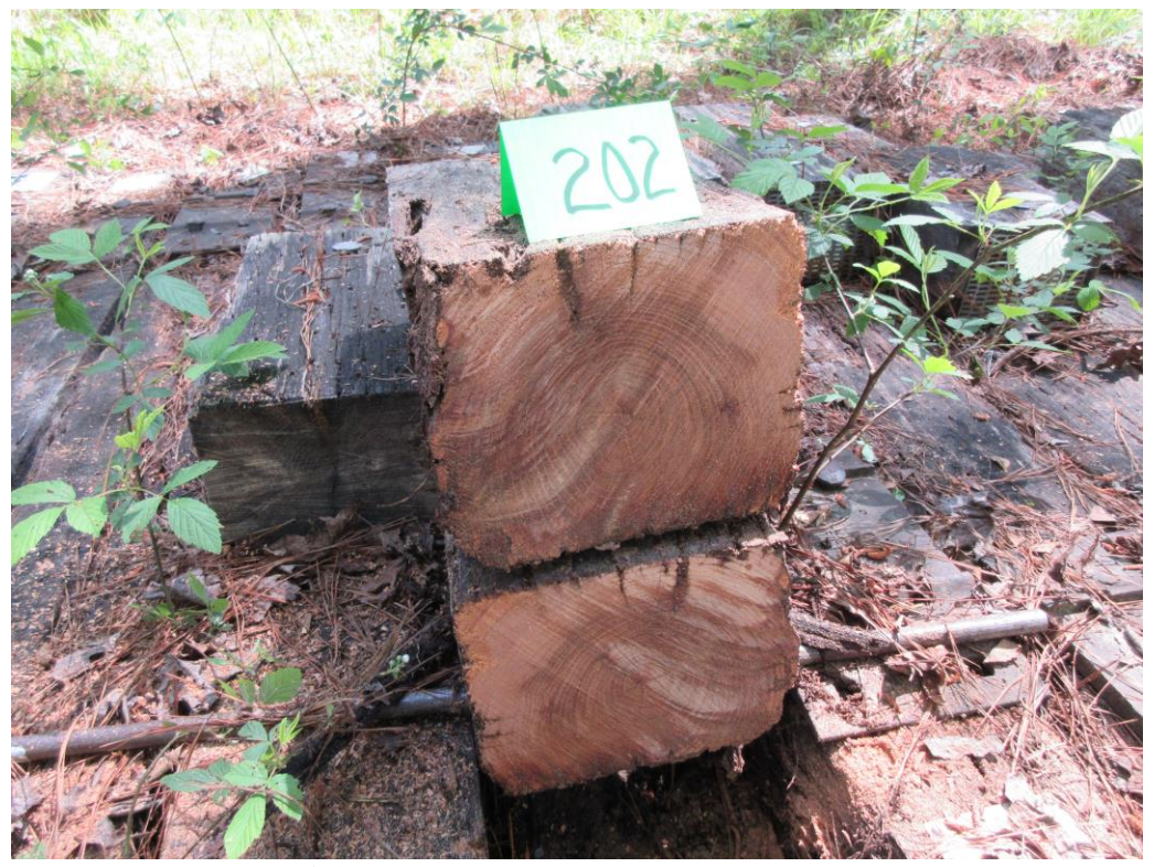
A40 - Tie #202 (Nisus/red oak/borate).