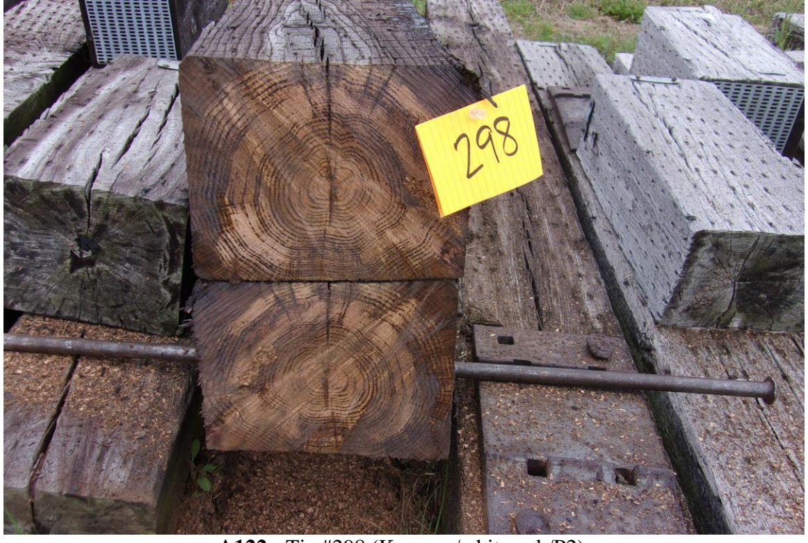
A122 - Tie #298 (Koppers/white oak/P2).