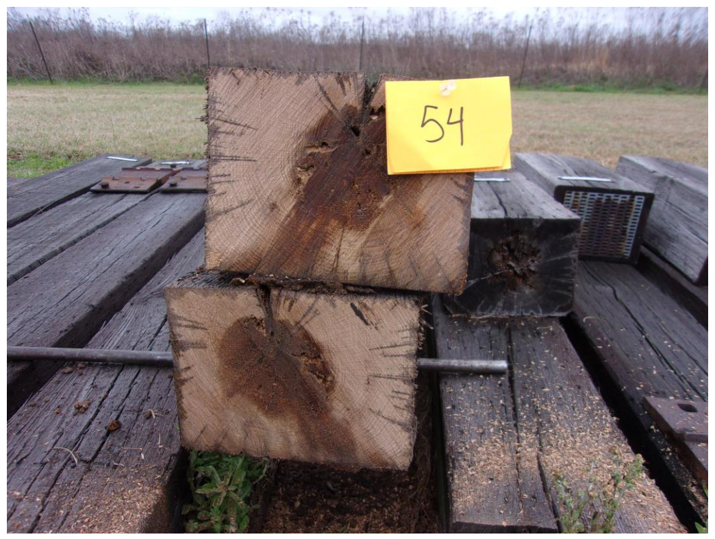
A76 - Tie #54 (Boatright/white oak//creosote to refusal) with internal decay.