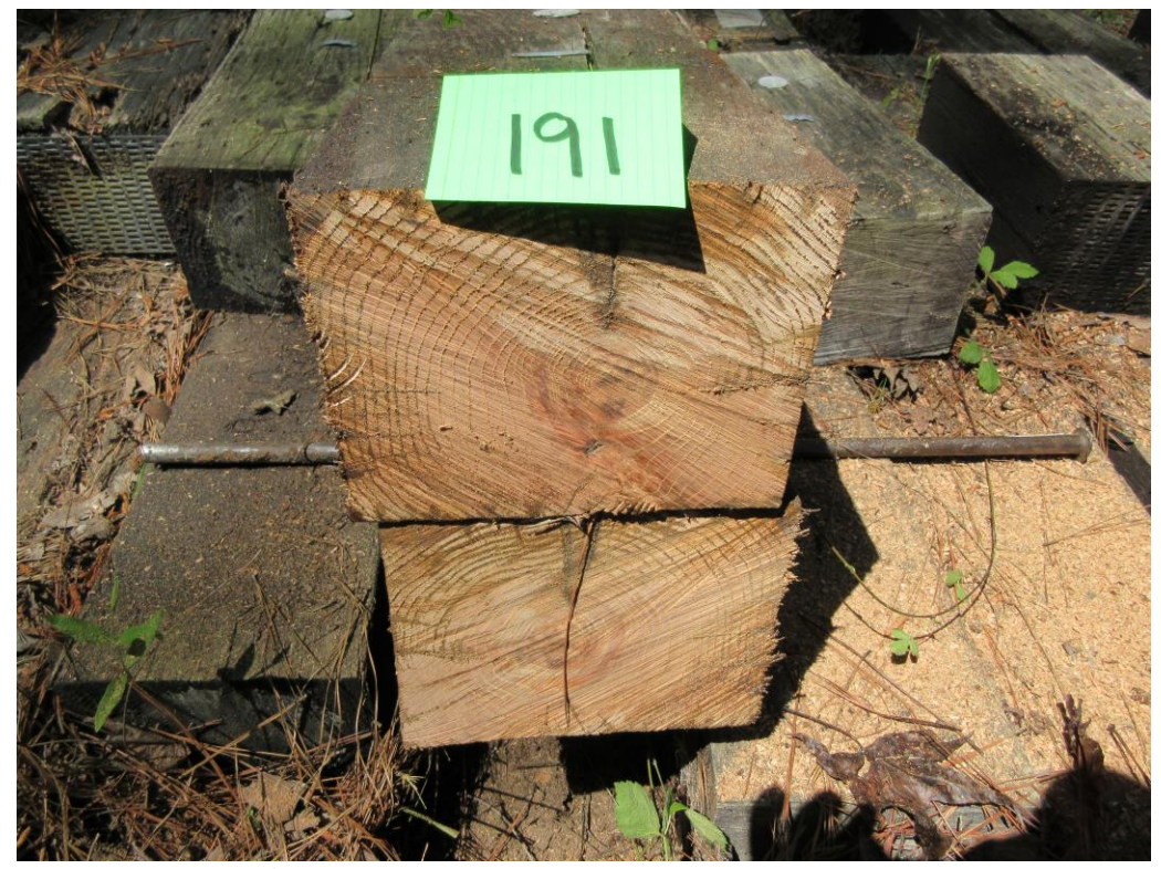
A38 - Tie # 190 (Nisus/red oak/borate/oil A).