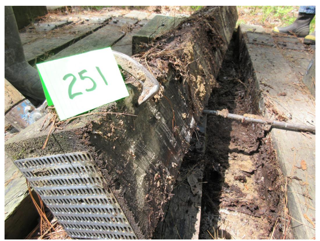
A51 - Tie #251 (Koppers/white oak/creosote petroleum solution).