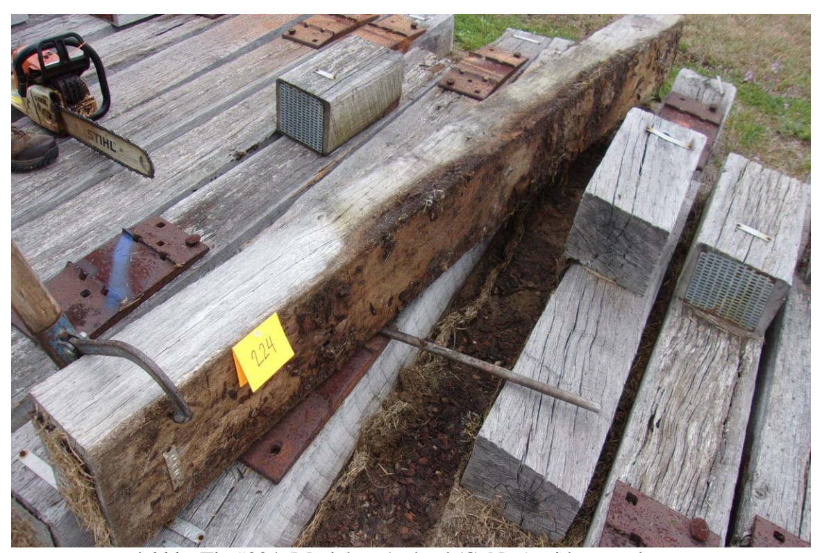
A111 - Tie #224 (Merichem/red oak/CuNap) with trace decay.