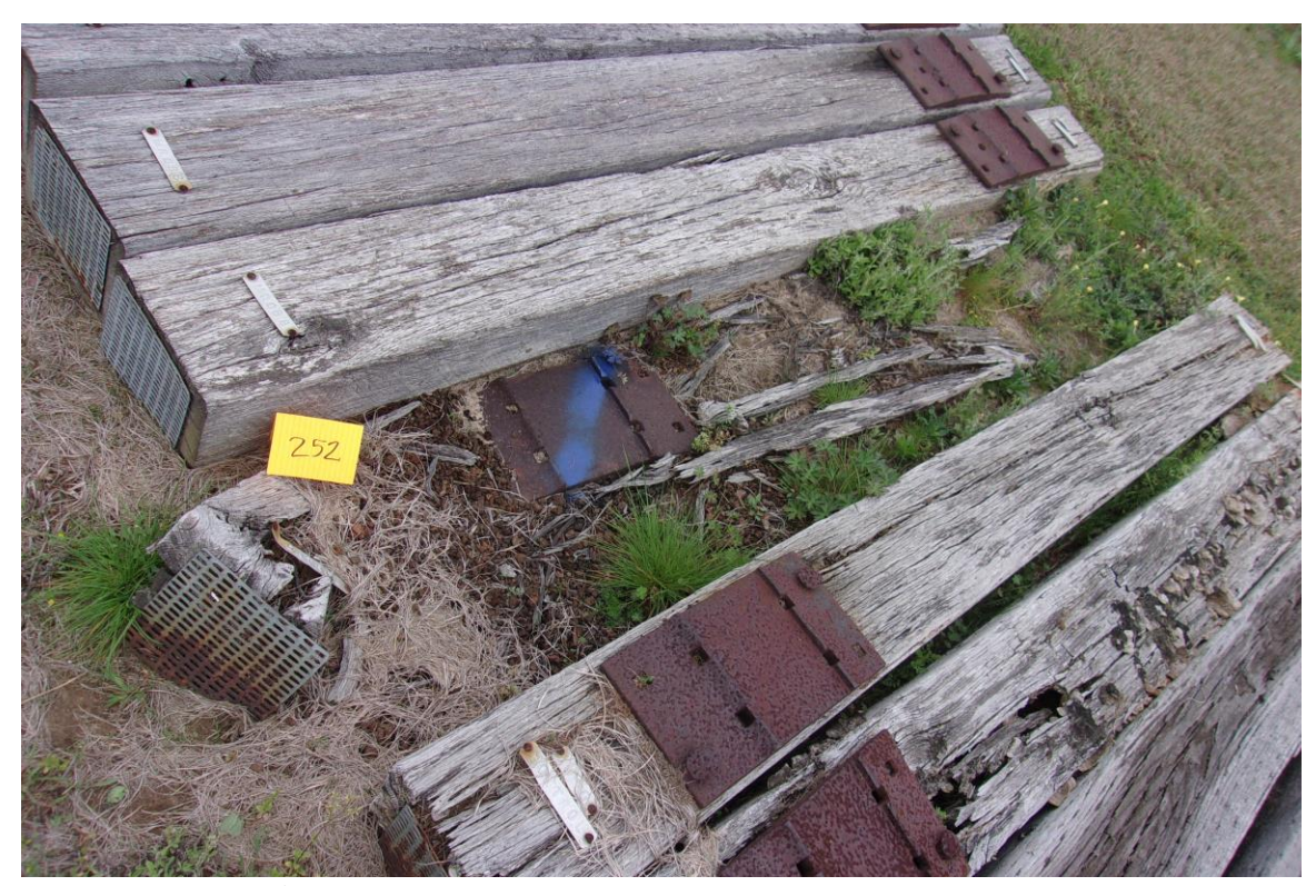
A97 - Tie #252 (untreated/red oak) failed due to decay