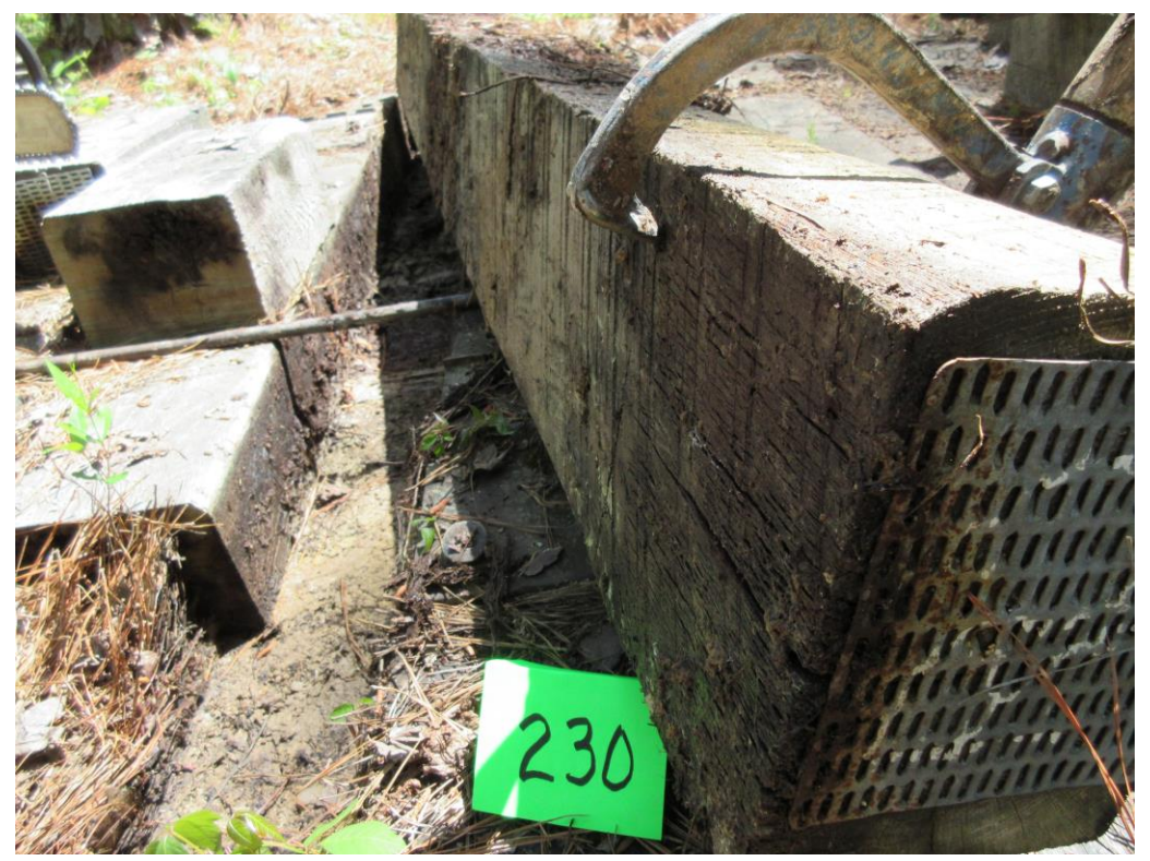
A47 - Tie #230 (Merichem/red oak/CuNap).