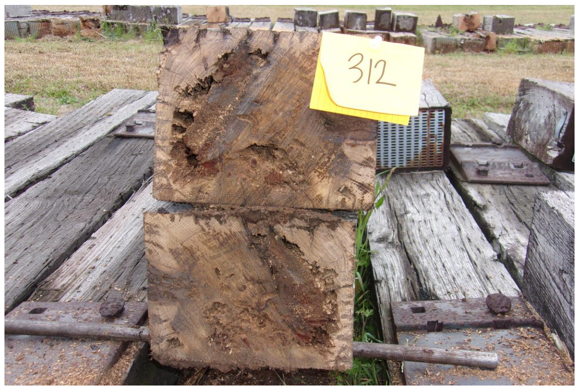
A126 - Tie #312 (Koppers/white oak/creosote petroleum solution) with internal decay.