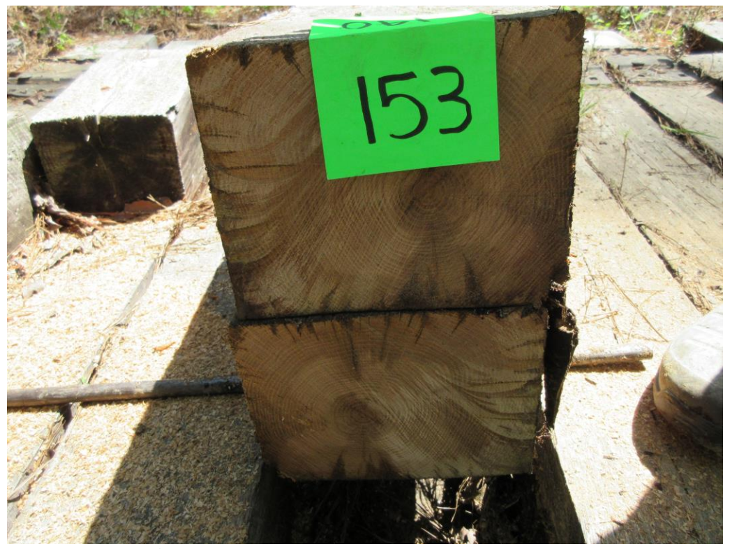
A 32 - Tie #153 (Nisus/white oak/borate/oil B).