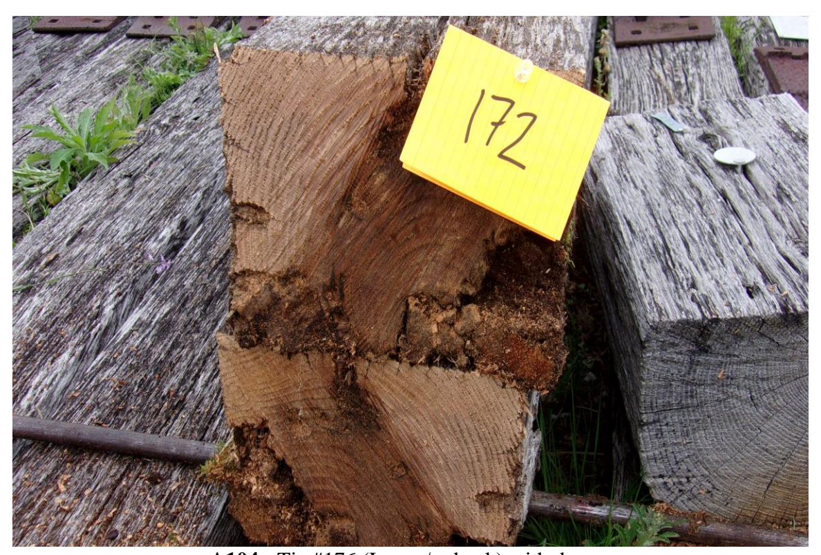
A104 - Tie #176 (Lonza/red oak) with decay.