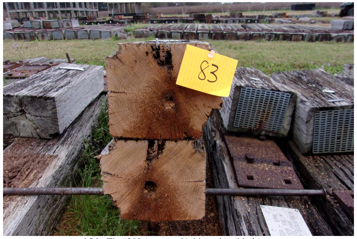
A96 - Tie #290 (untreated/white oak) with decay.