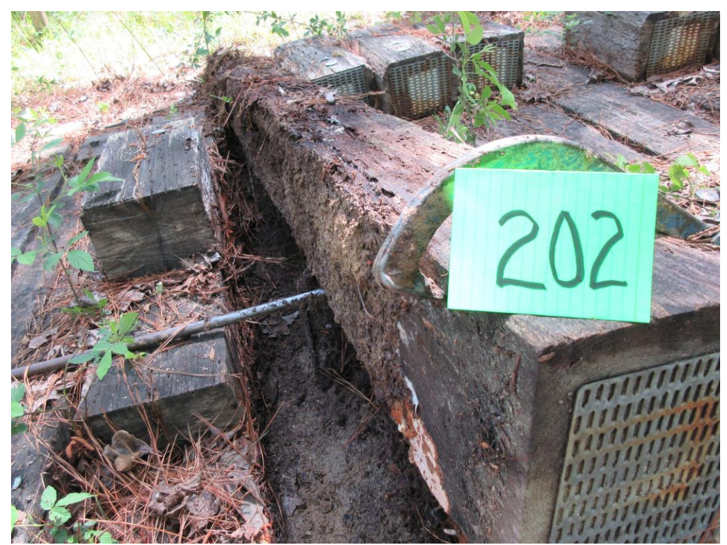
A39 - Tie #202 (Nisus/red oak/borate) decay & trace termite attack on bottom.