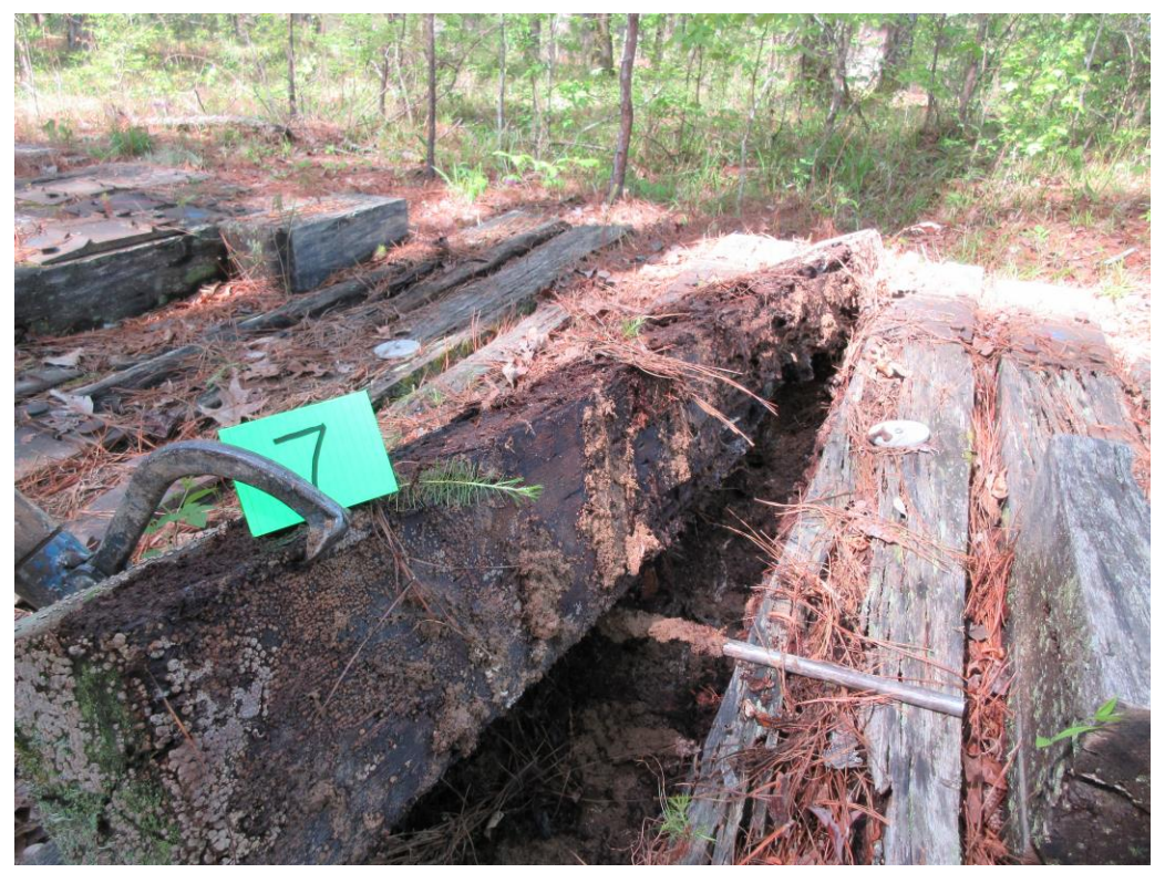
A1 - Tie #7 (Cedarcide/white oak) with heavy decay.