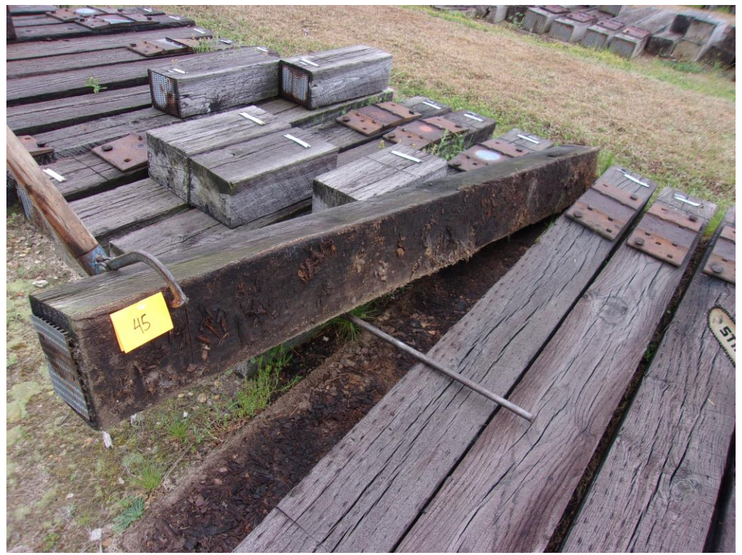
A73 - Tie #45 (Boatright/red oak/borate-creosote 5pcf).