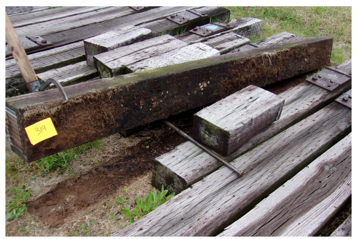
A127 - Tie #319 (Koppers/red oak/P2 creosote).