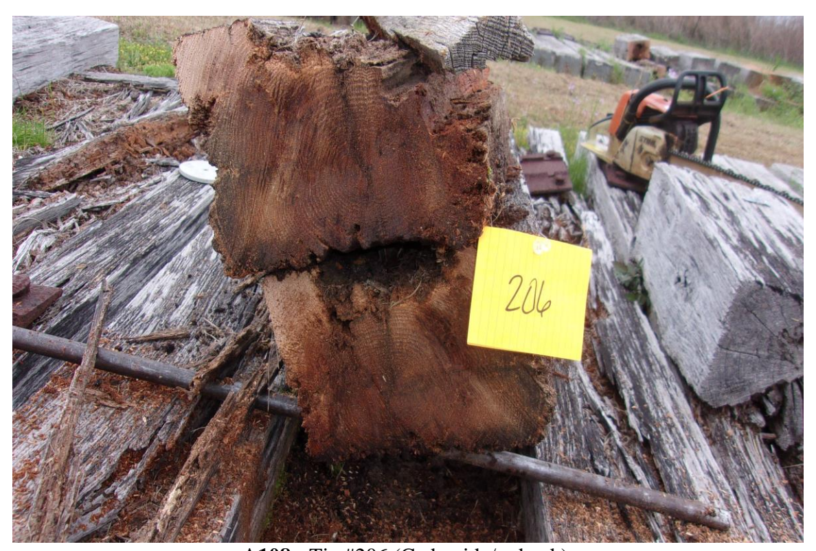
A108 - Tie #206 (Cedarcide/red oak).