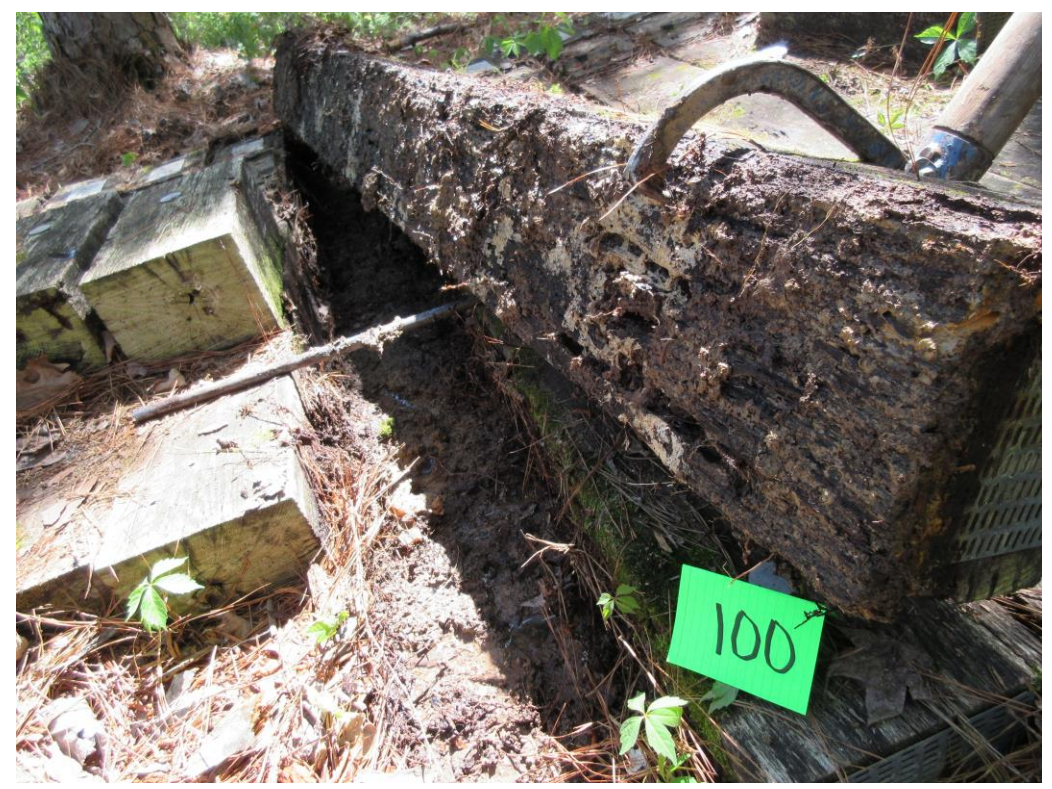
A19 - Tie #100 (Lonza/red oak) with moderate decay on bottom.