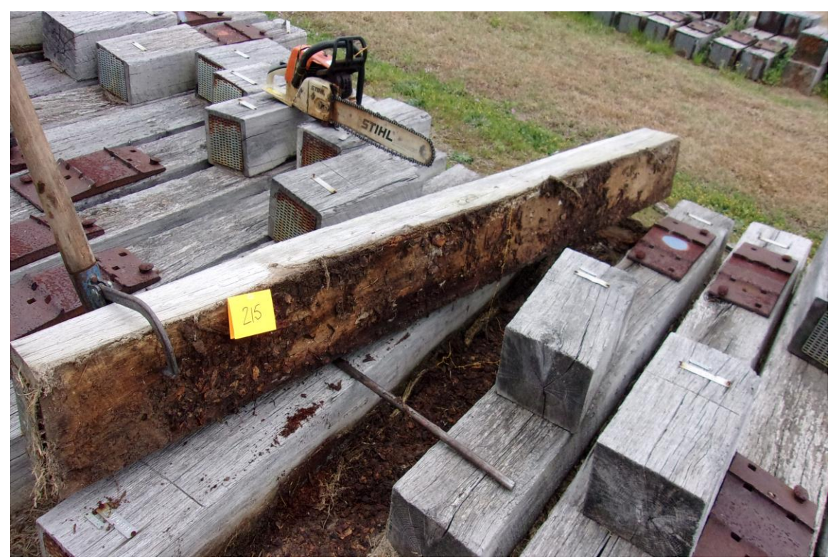
A109 - Tie #215 (Merichem/white oak/borate/CuNap).