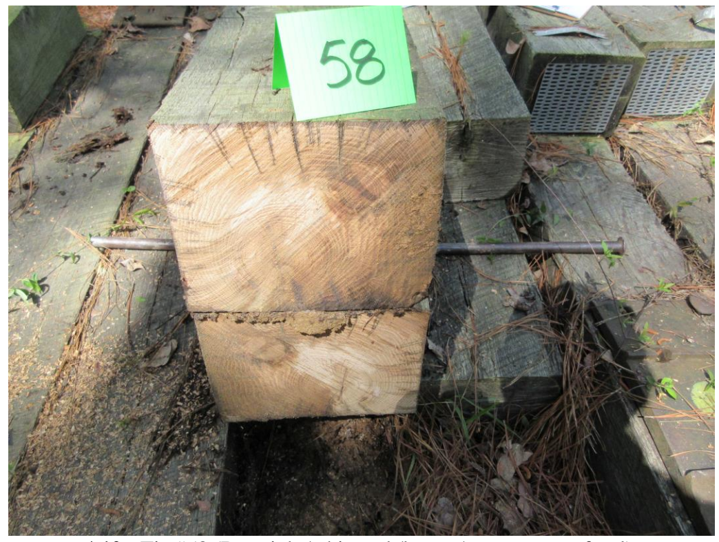
A10 - Tie #58 (Boatright/white oak/borate/creosote to refusal).