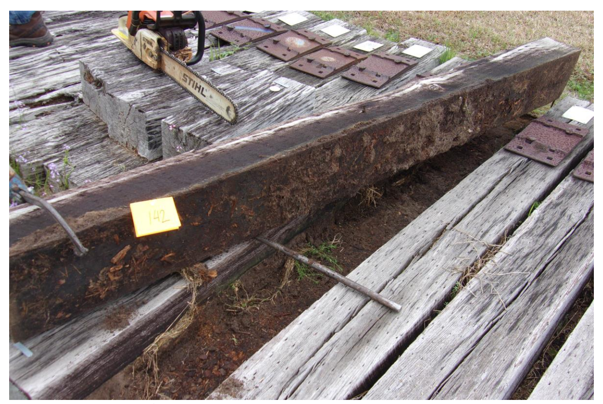
A91 - Tie #142 (Nisus/white oak/borate/oil A).