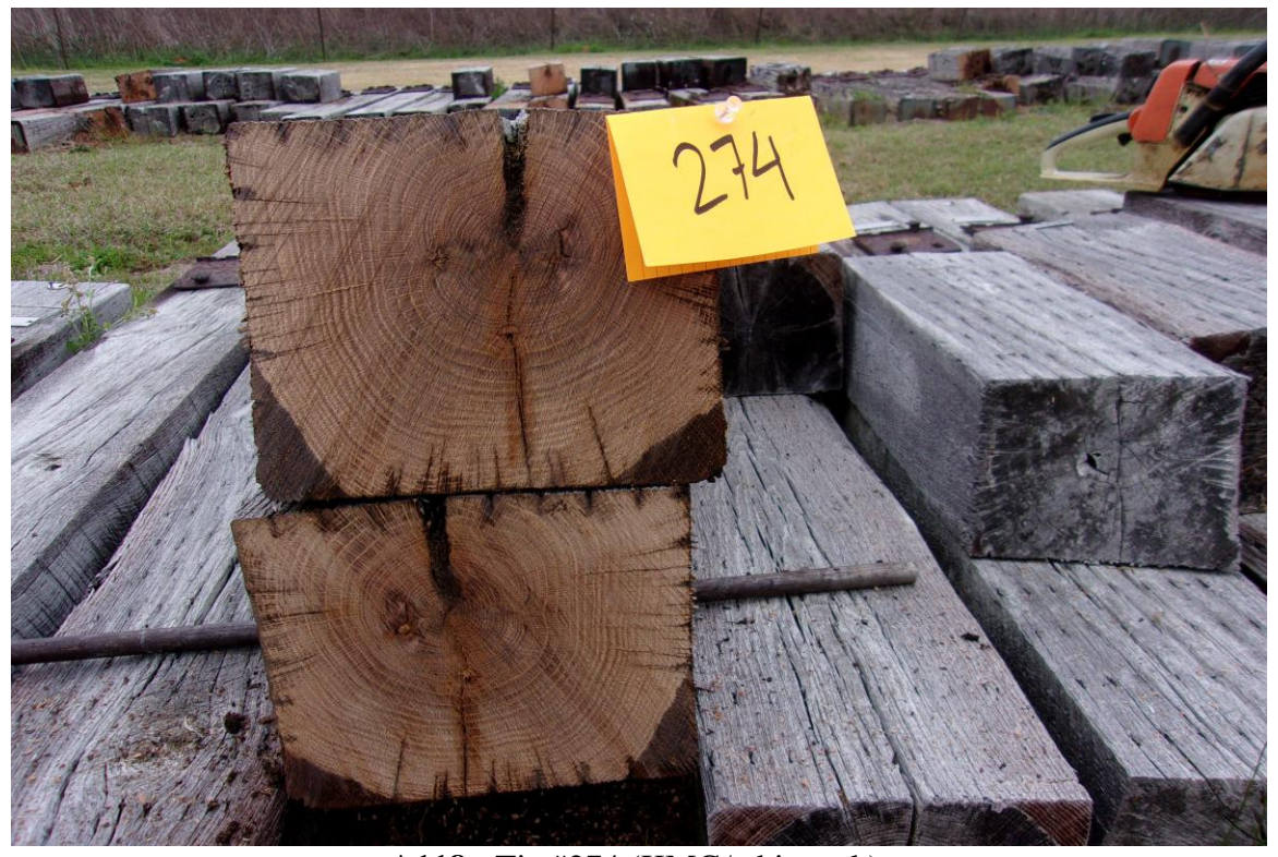
A118 - Tie #274 (KMG/white oak).