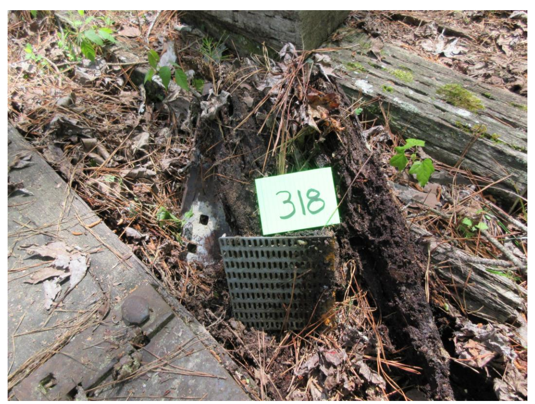
A29 - Tie #318 (untreated/red oak) completely deteriorated.