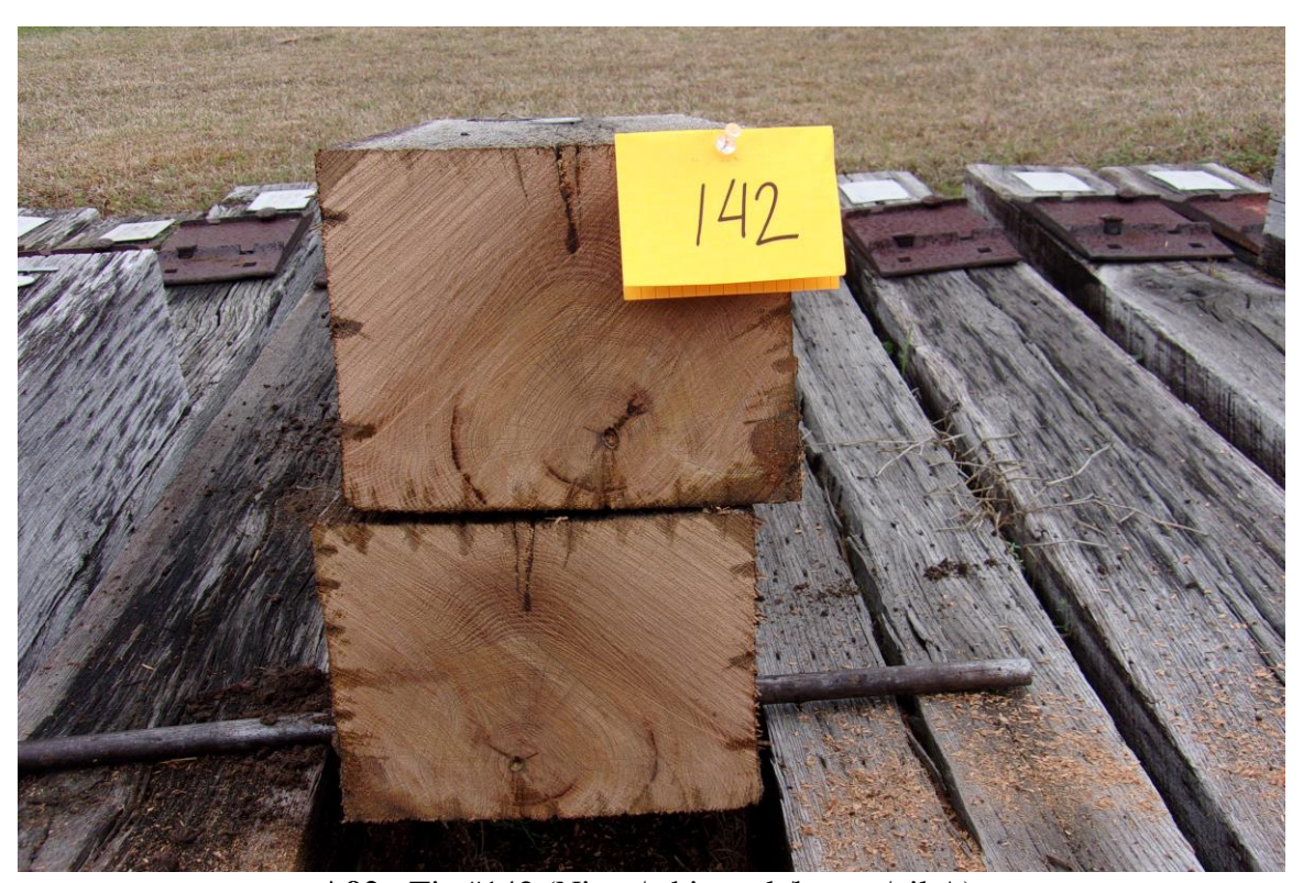
A92 - Tie #142 (Nisus/white oak/borate/oil A).