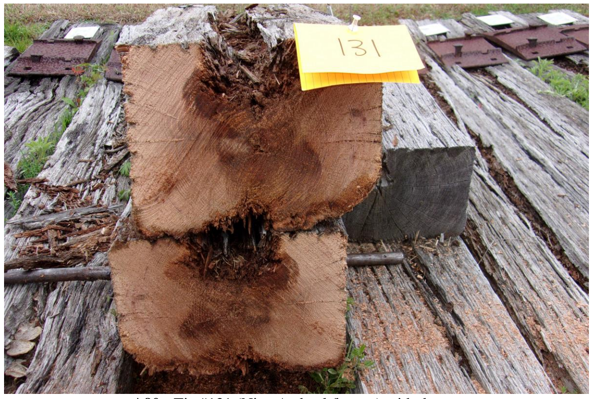
A90 - Tie #131 (Nisus/red oak/borate) with decay.