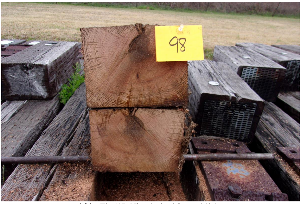
A84 – Tie #97 (Nisus/red oak/borate/oil A).