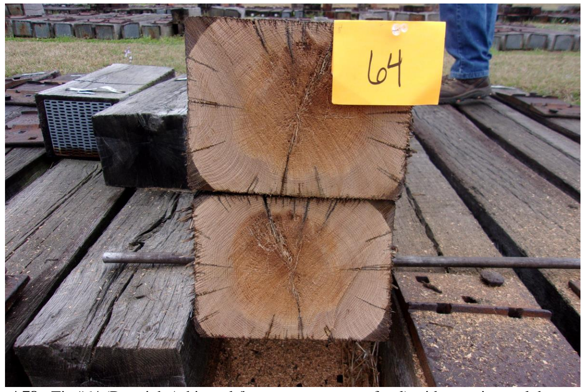
A78 - Tie #64 (Boatright/white oak/borate-creosote to refusal) with trace internal decay.