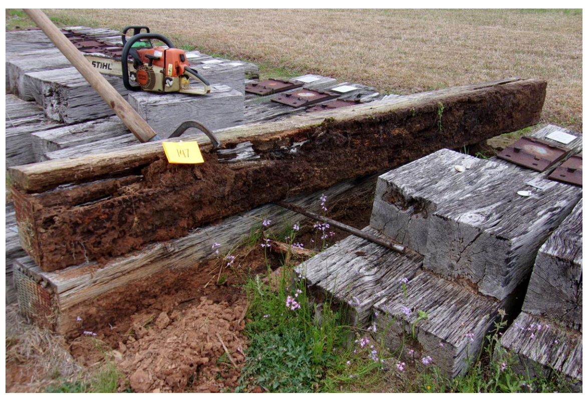
A93 - Tie #147 (Lonza/white oak) with decay and active Formosan termites.