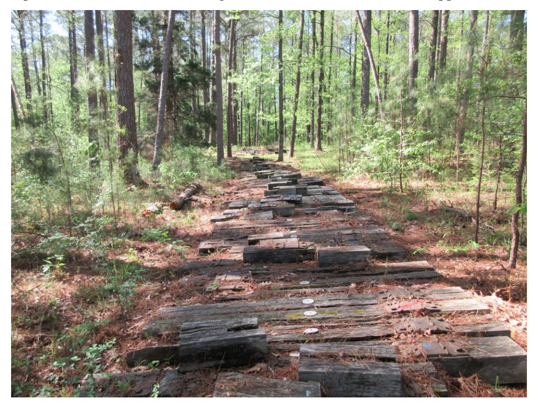
Figure 1 - An overall view of exposure Site 1 illustrating the conditions at the time of inspection.

General Observations: No unexpected results were found but biological deterioration in the controls indicates the testing is valid. As in the past checks and/or splits were noted to be worse at Site 2 probably due to more direct sunlight exposure. Termite activity had noticeably increased at this site (all live termites found were Coptotermes formosanus as noted in previous reports ). Ties at Site 1 were more moist/wet due to the significant rain fall, shade and leaf litter as well as the clay soil at this site and these ties showed an increased amount of decay in the controls and more wide spread termite activity ( Reticulitermes flavipes )due to these conditions. A few photographs documenting the condition of the sites can be seen below (Figures 1 - 2). The tie number denotes the position of exposure as recorded on the plot-maps. Copies of the inspection forms and photo documentation of the segmented ties can be found in the appendix.