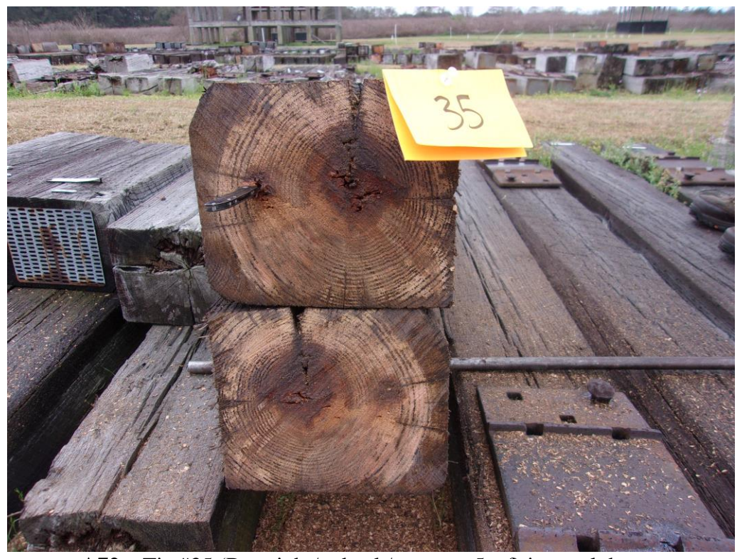
A72 – Tie #35 (Boatright/red oak/creosote 5pcf) internal decay.