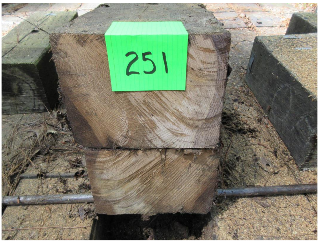
A52 - Tie #251 (Koppers/white oak/creosote petroleum solution).