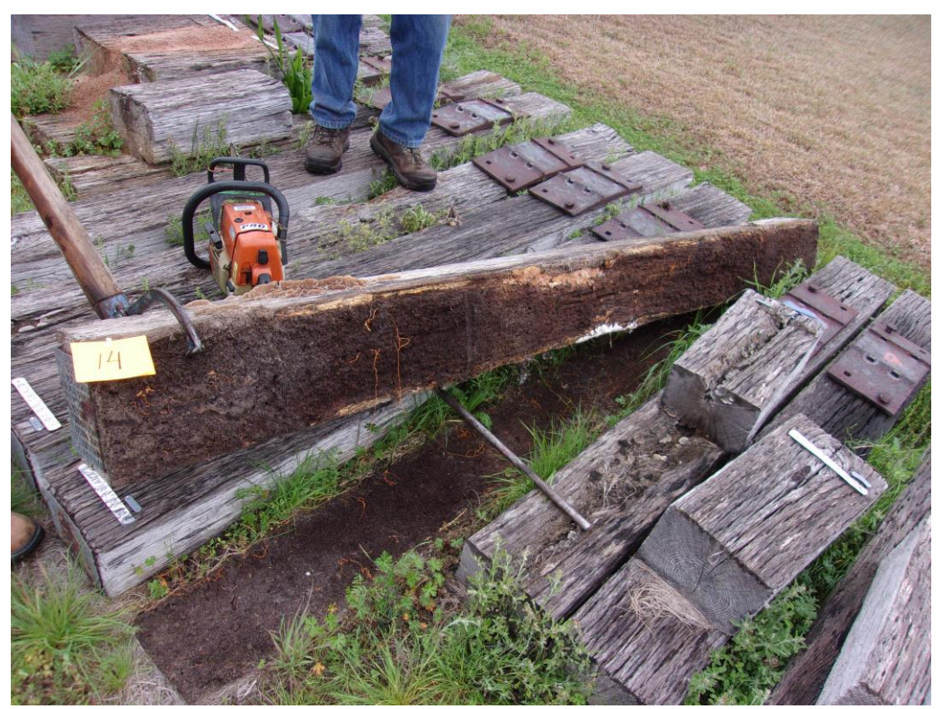
A67 – Tie #14 (Envirosafe/red oak) with decay.