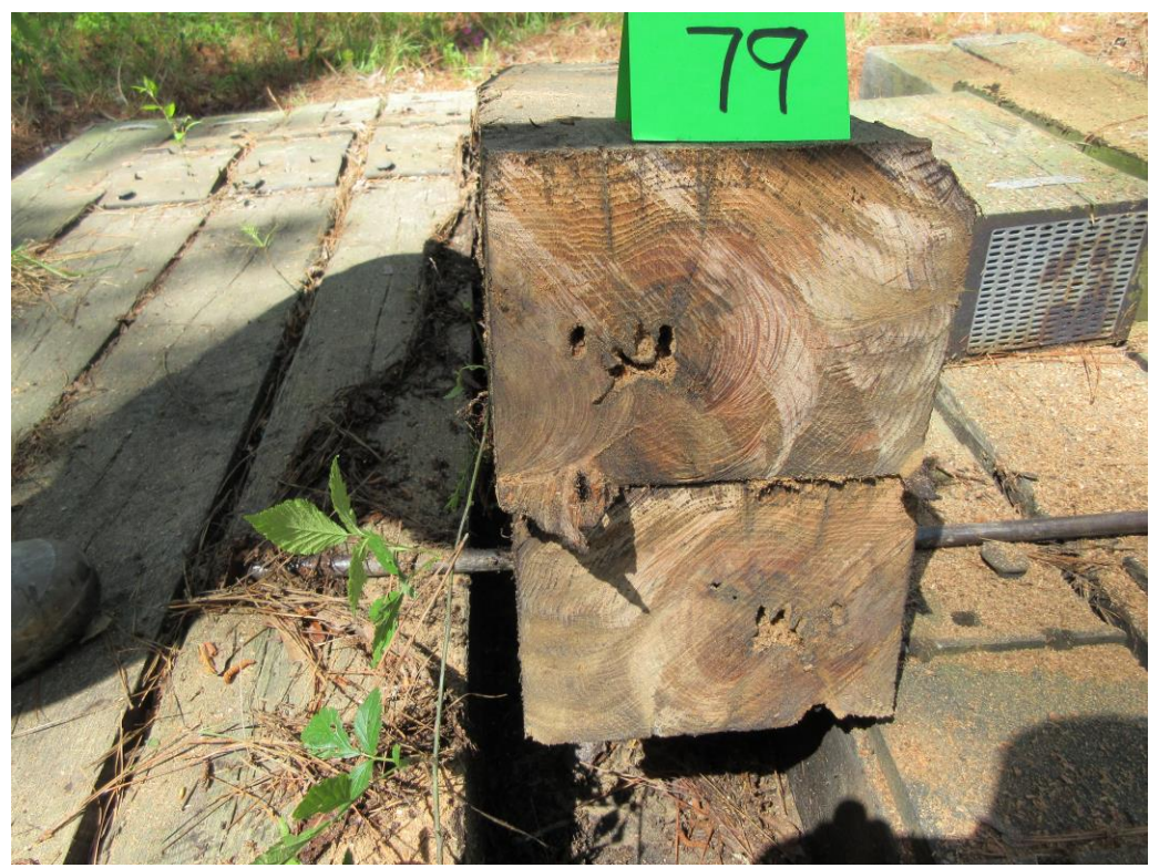
A14 - Tie #79 (Boatright/red oak/borate/creosote 5pcf).