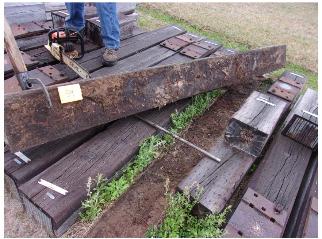
A75 - Tie #54 (Boatright/white oak//creosote to refusal).