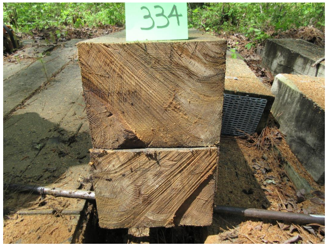
A60. Tie #334 (Merichem/white oak/CuNap).