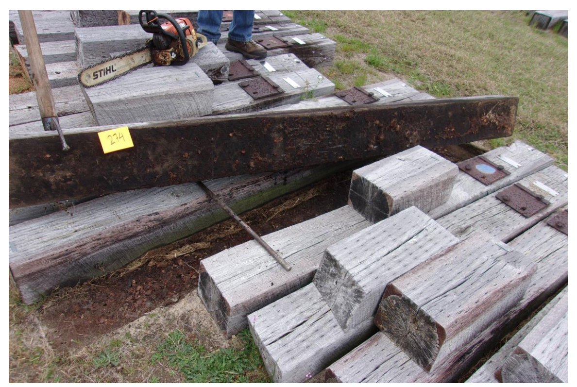
A117 - Tie #274 (KMG/white oak).