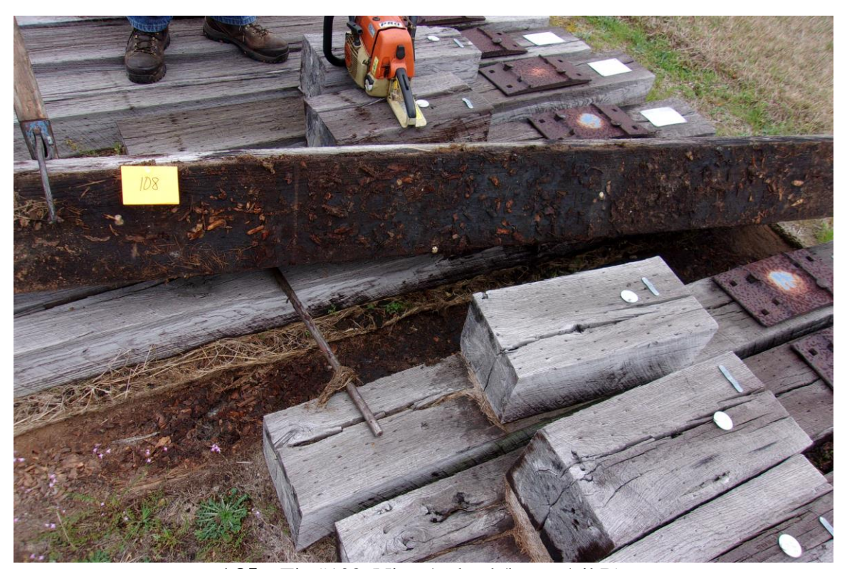
A85 – Tie #108 (Nisus/red oak/borate/oil B).