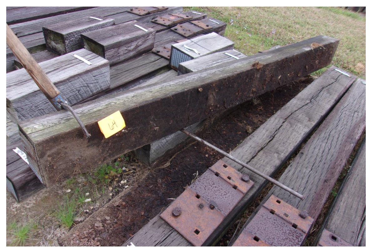
A77 - Tie #64 (Boatright/white oak/borate-creosote to refusal).