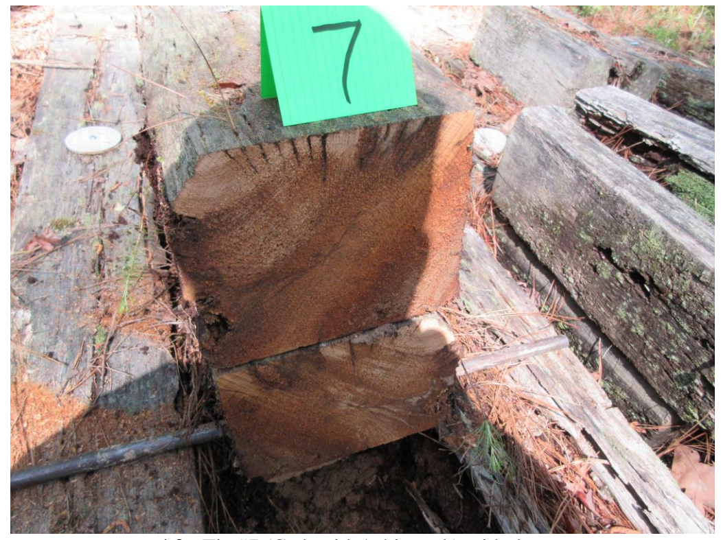
A2 - Tie #7 (Cedarcide/white oak) with decay.