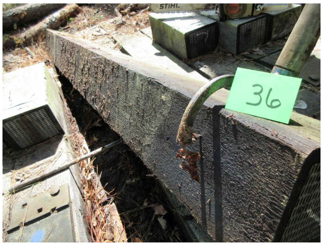
A7 – Tie #36 (Boatright/red oak/borate/creosote 7pcf).