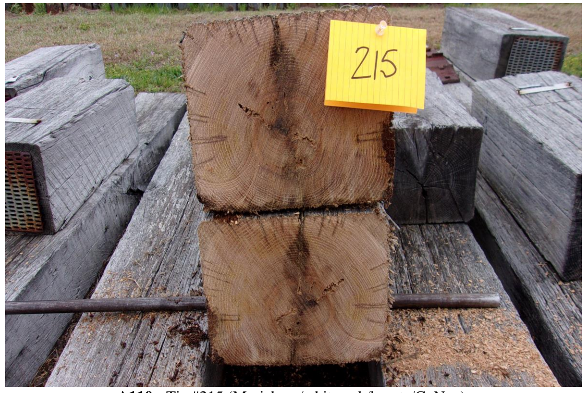
A110 - Tie #215 (Merichem/white oak/borate/CuNap).