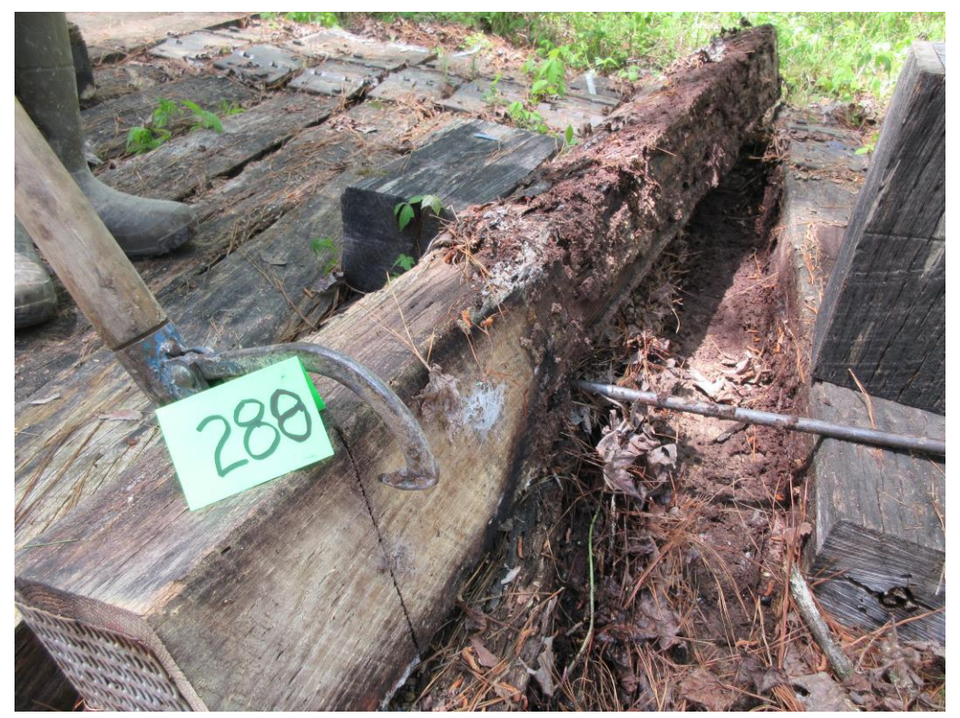
A61 - Tie #288 (Envirosafe/red oak) with moderate decay on bottom.