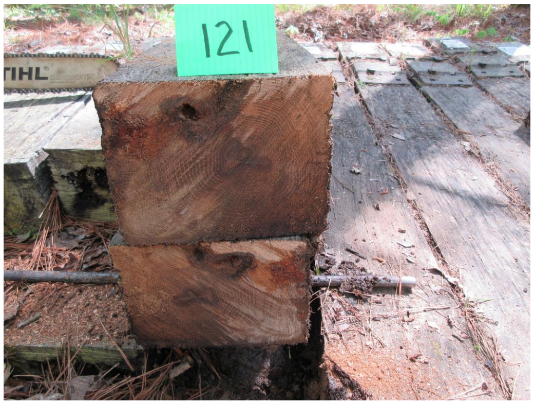
A24 - Tie #121 (Lonza/red oak).