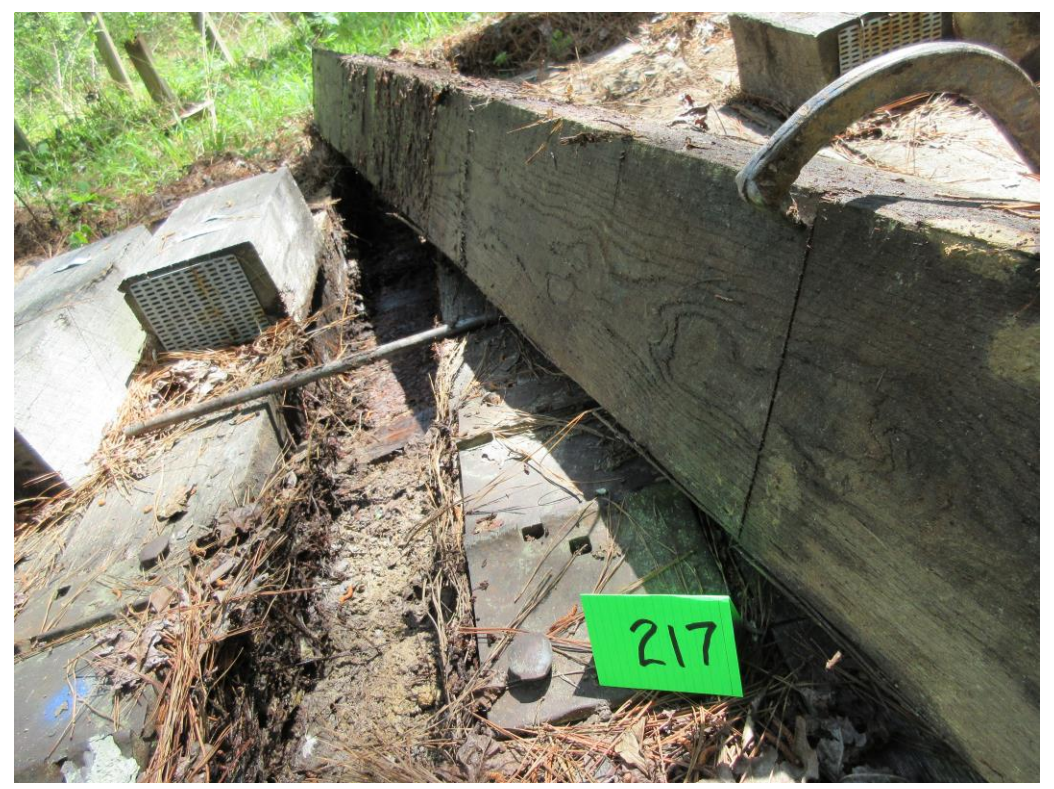
A43 - Tie #217 (Merichem/red oak/borate/CuNap).