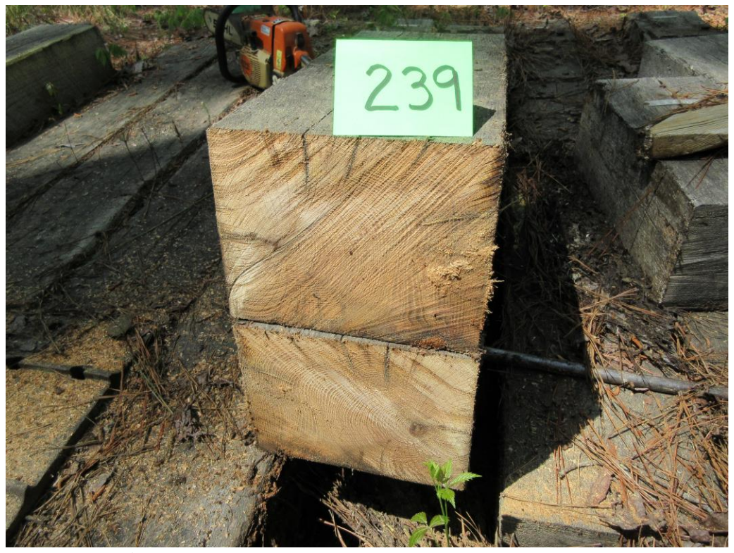
A50 - Tie #239 (Merichem/white oak/borate/CuNap).