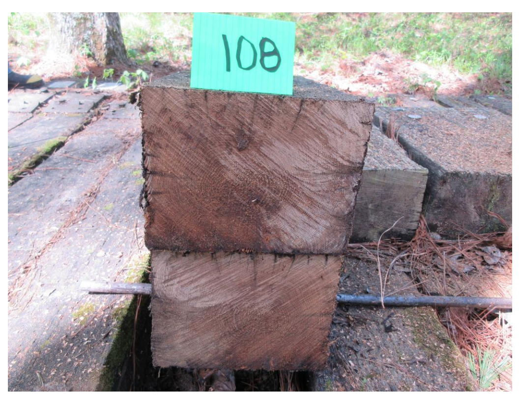
A22 - Tie #108 (Lonza/white oak).