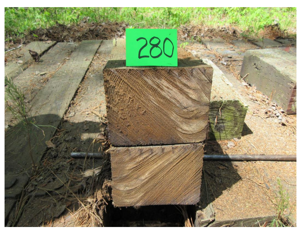
A58 - Tie #280 (Koppers/red oak/P2 creosote).