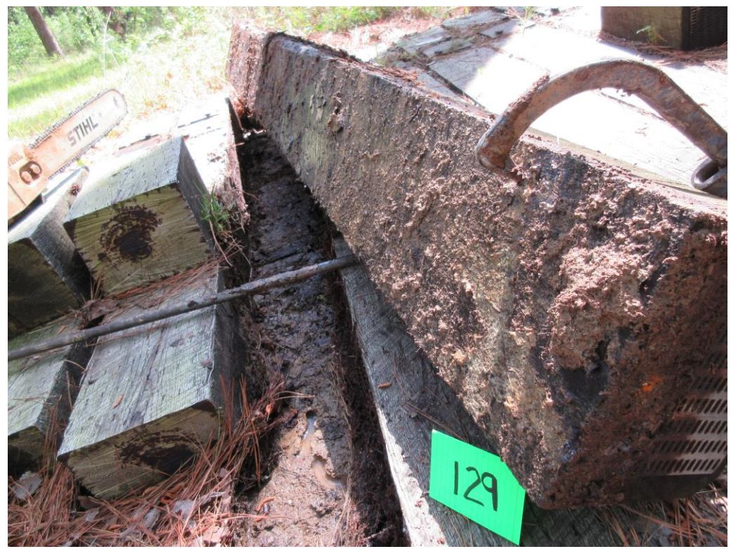
A25 - Tie #129 (KMG/red oak).