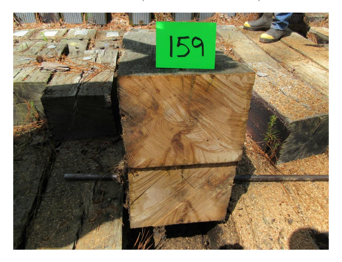
A34 - Tie #159 (Nisus/white oak/borate/oil A).