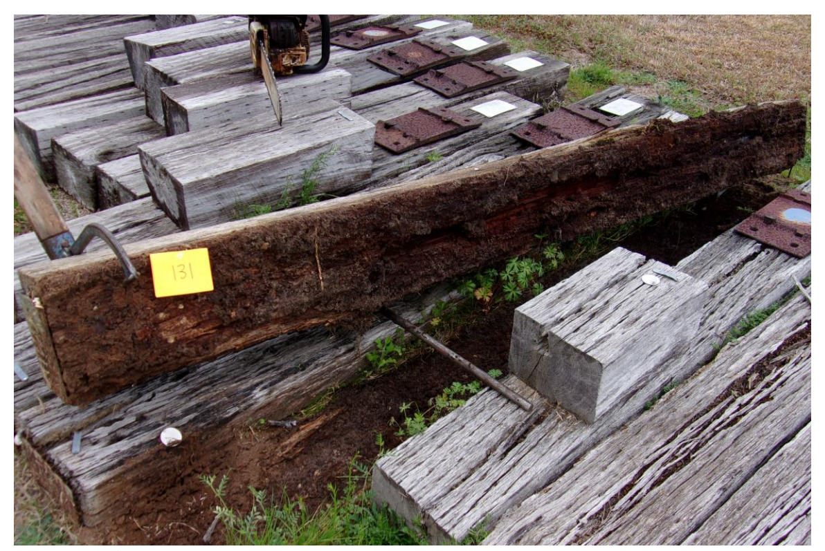
A89 – Tie #131 (Nisus/red oak/borate) with decay on top & bottom.