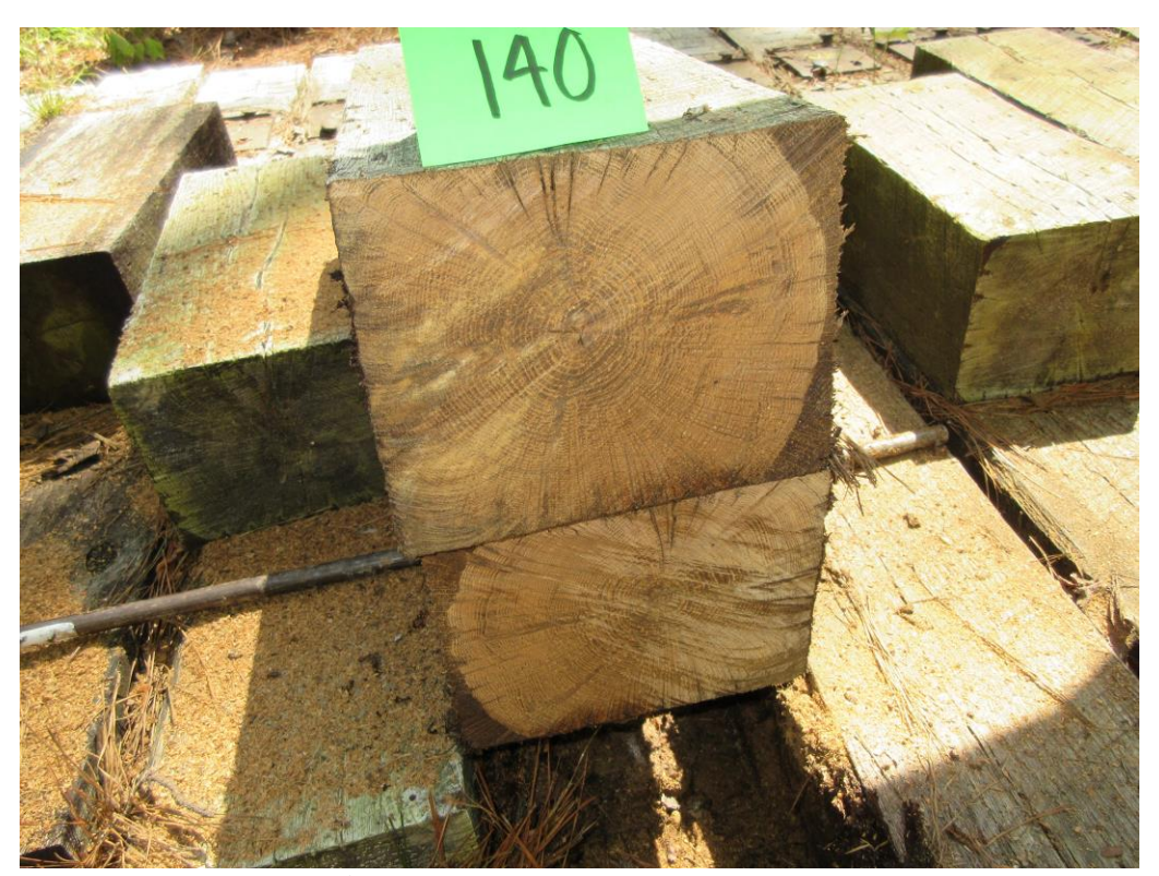
A28 - Tie #140 (KMG/white oak).