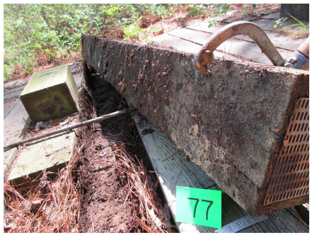
A11 - Tie #77 (Boatright/red oak/creosote 5pcf).