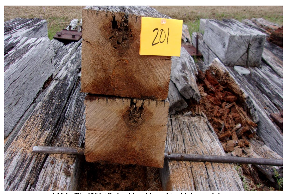
A106 - Tie #201 (Cedarcide/white oak) with internal decay.