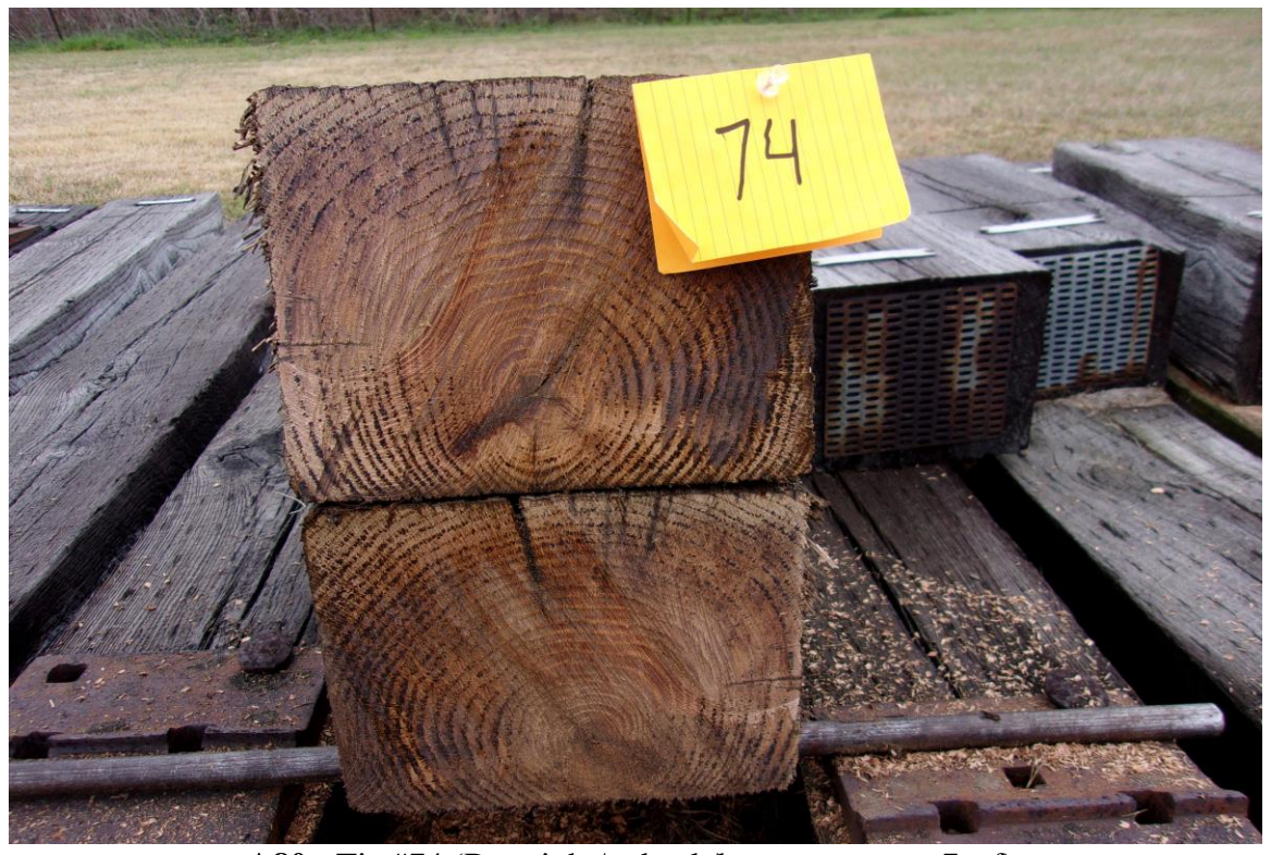
A80 - Tie #74 (Boatright/red oak/borate-creosote 7pcf).