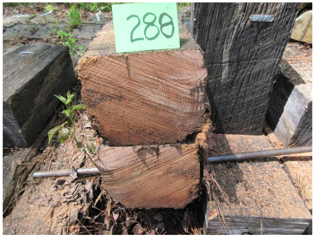
A62 - Tie #288 (Envirosafe/red oak) with decay on bottom & side faces.