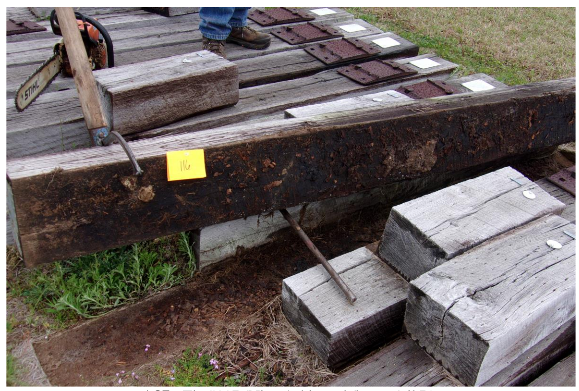
A87 - Tie #117 (Nisus/white oak/borate/oil B).