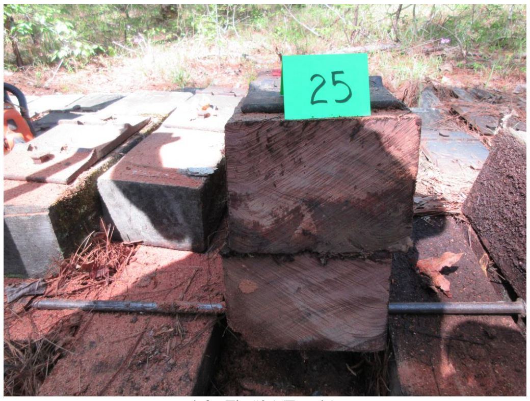
A6 – Tie #25 (Turada).