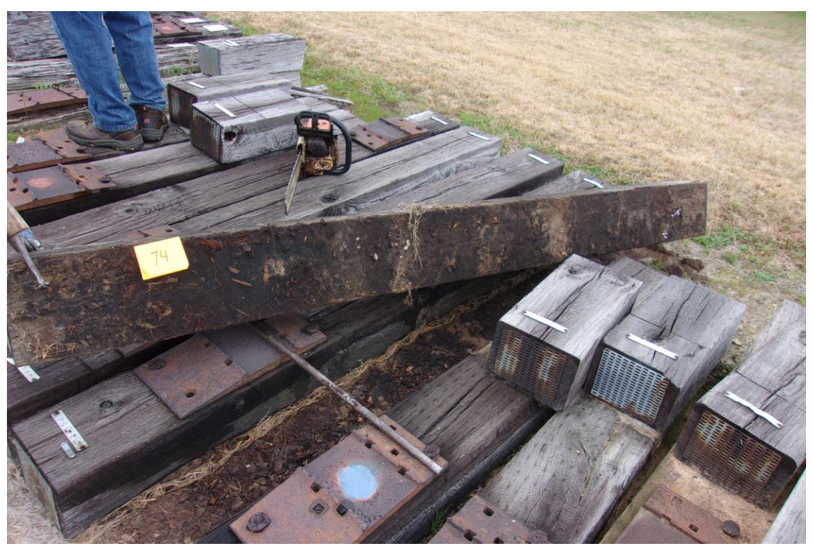
A79 - Tie #74 (Boatright/red oak/borate-creosote 7pcf).