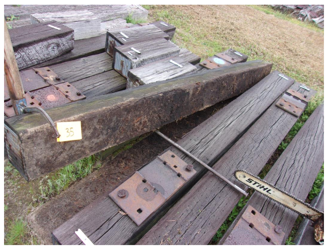
A71 – Tie #35 (Boatright/red oak/creosote 5pcf).