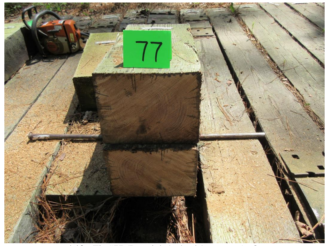
A12 - Tie #77 (Boatright/red oak/creosote 5pcf).