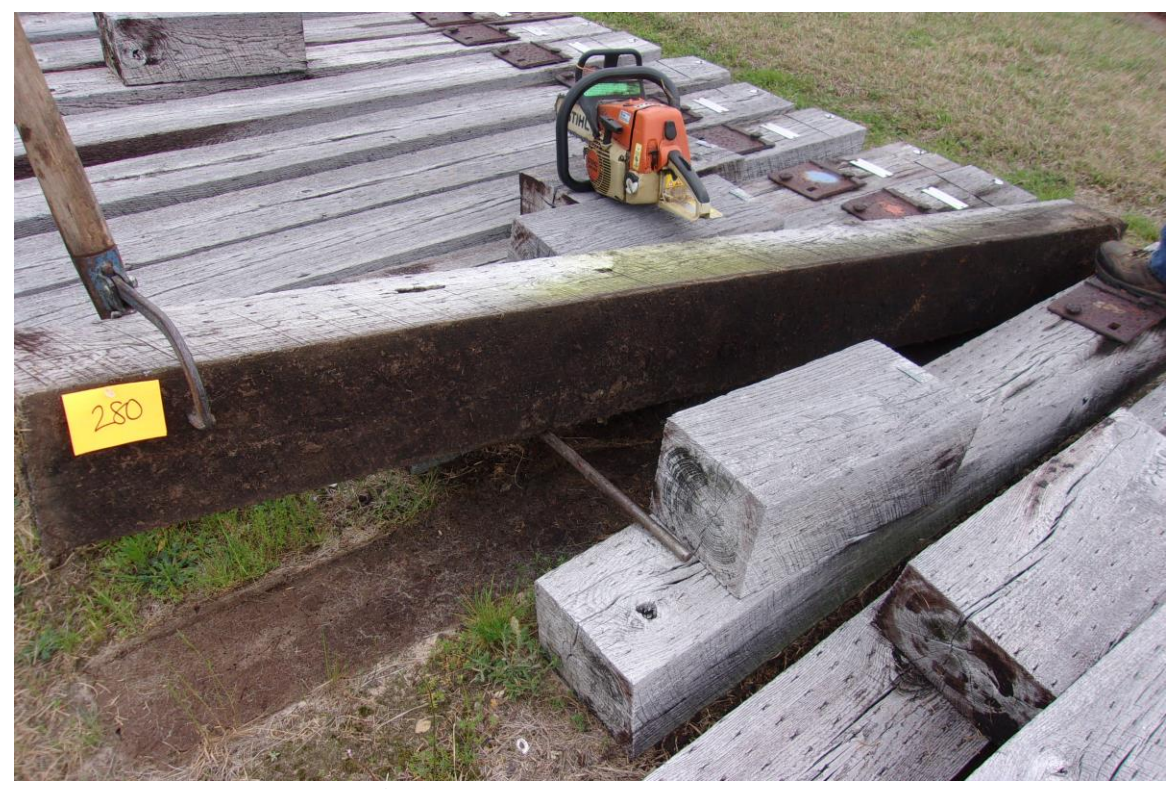
A119 - Tie #280 (KMG/red oak).