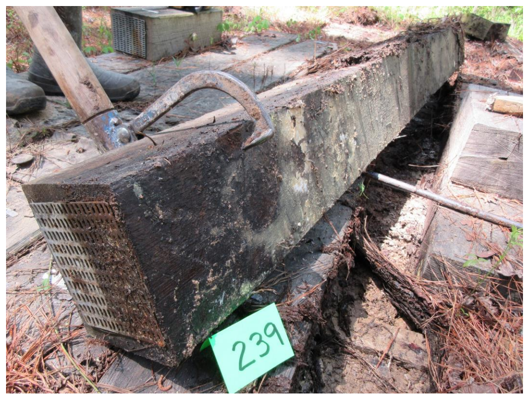
A49 - Tie #239 (Merichem/white oak/borate/CuNap).