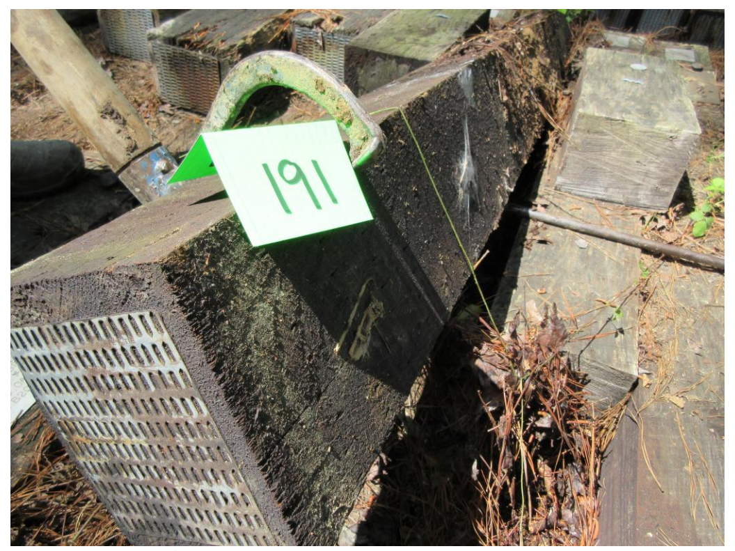
A37 - Tie #191 (Nisus/red oak/borate/oil A).