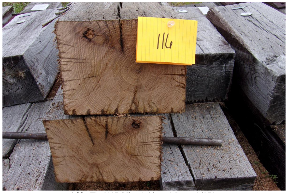
A88 - Tie #117 (Nisus/white oak/borate/oil B).