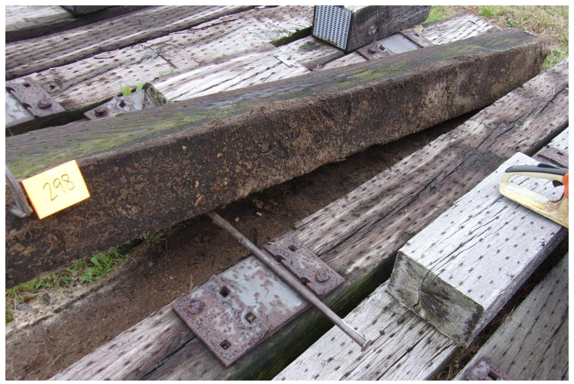
A121 - Tie #298 (Koppers/white oak/P2).