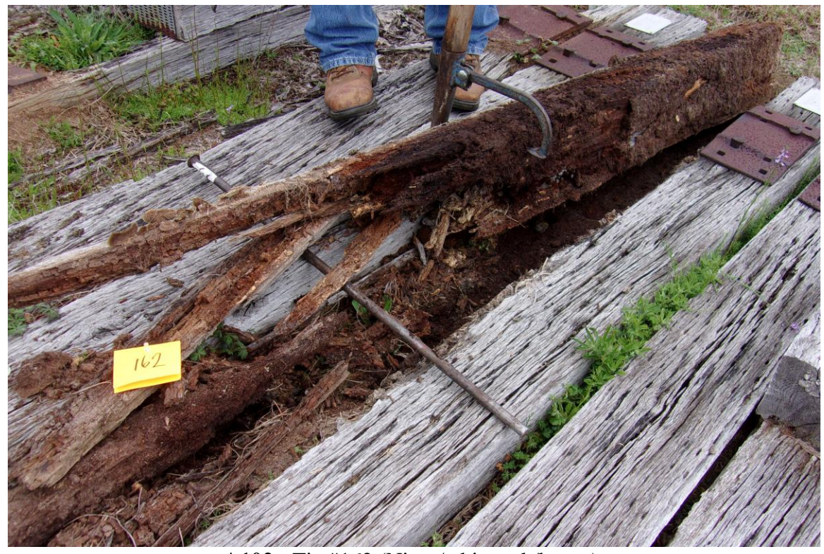
A102 - Tie #162 (Nisus/white oak/boron).