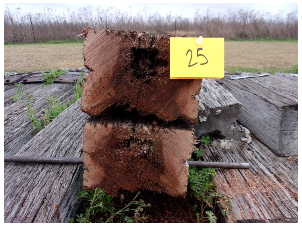
A70 – Tie #25 (Envirosafe/white oak) with extensive decay.