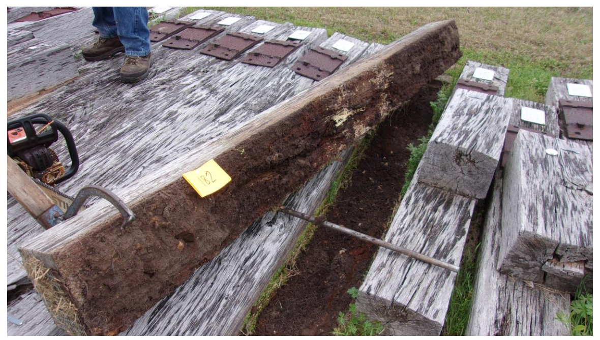
A99 - Tie #182 (Lonza/white oak) with decay evident.