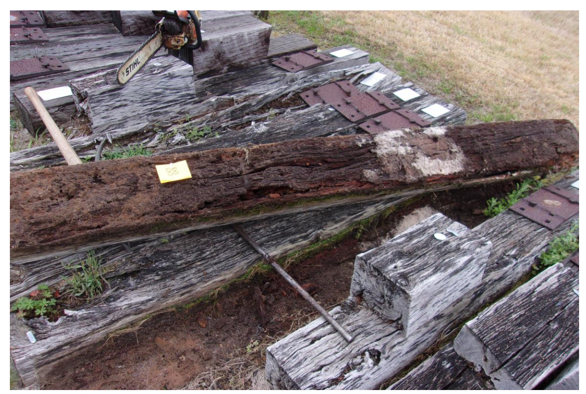
A81 - Tie #88 (Lonza/red oak) decay and termite damage on bottom.