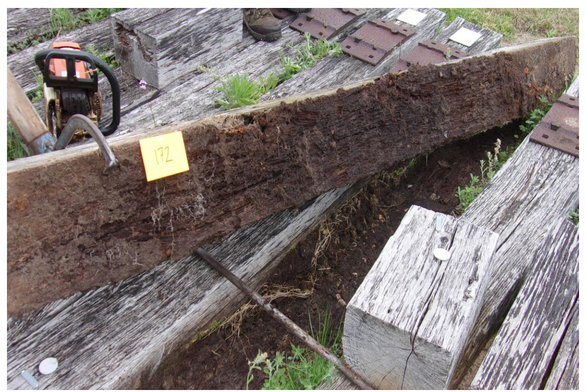
A103 – Tie #172 (Lonza/red oak) with decay and termite damage.