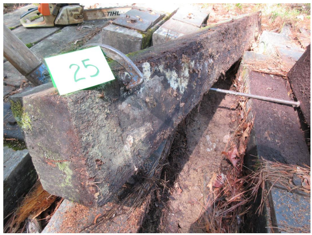
A5 – Tie #25 (Turada) with decay on bottom and side.