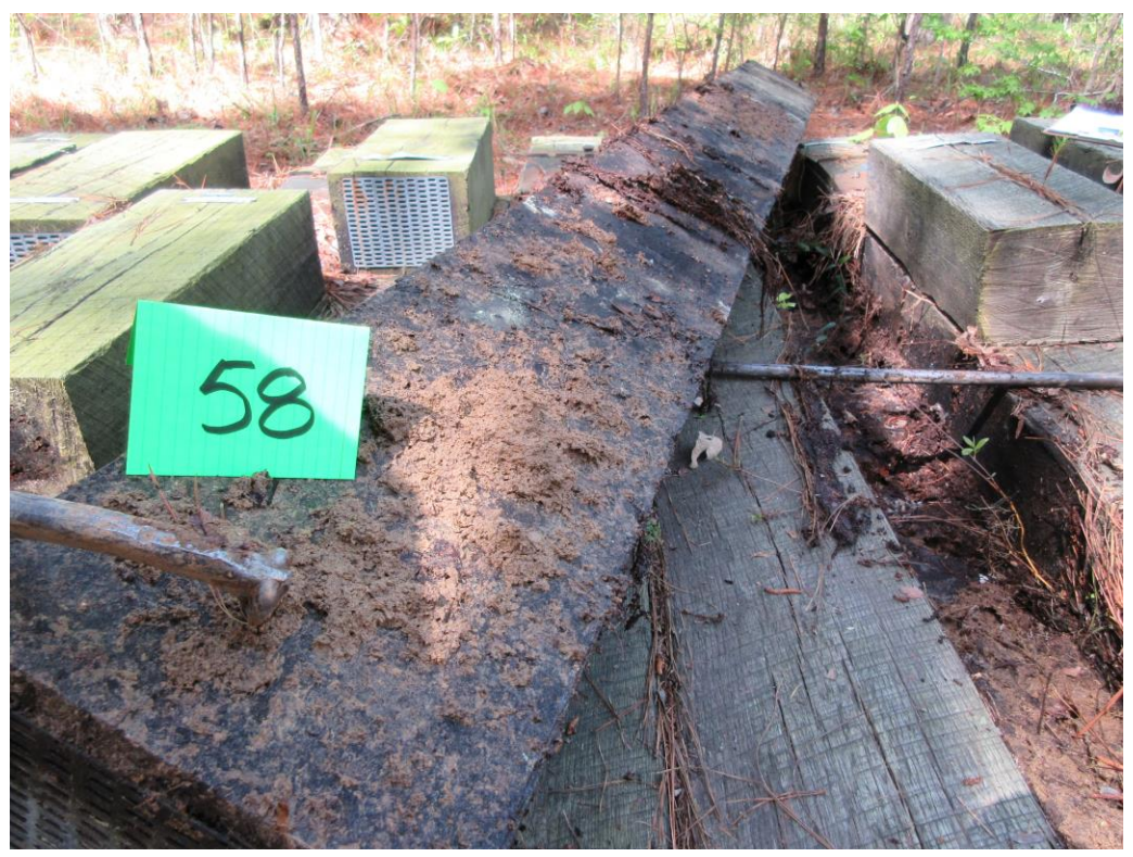
A9 - Tie #58 (Boatright/white oak/borate/creosote to refusal).