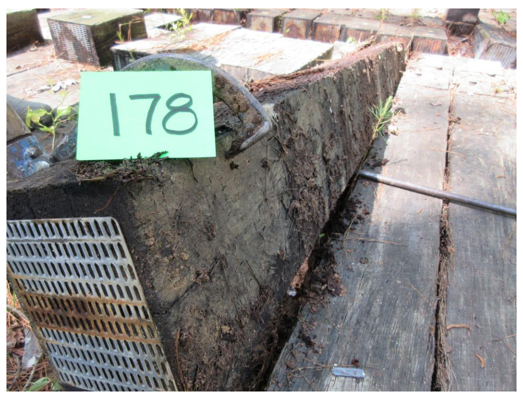
A35 Tie #178 (Nisus/red oak/borate/oil B).