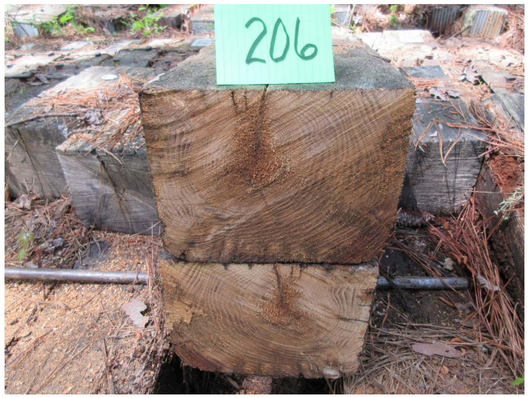
A42 - Tie #206 (Nisus/white oak/borate) with decay near checks & on bottom.