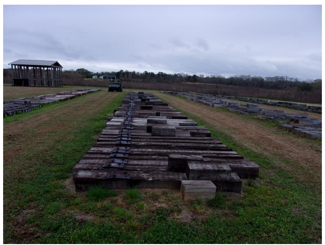
Figure 2 - A general photograph of Site 2 at the time of inspection.