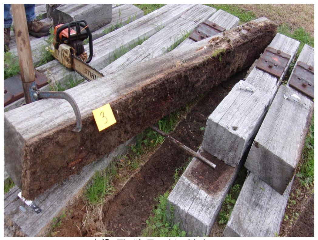
A65 - Tie #3 (Turada) with decay.