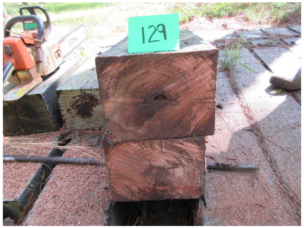
A26 - Tie #129 (KMG/red oak).