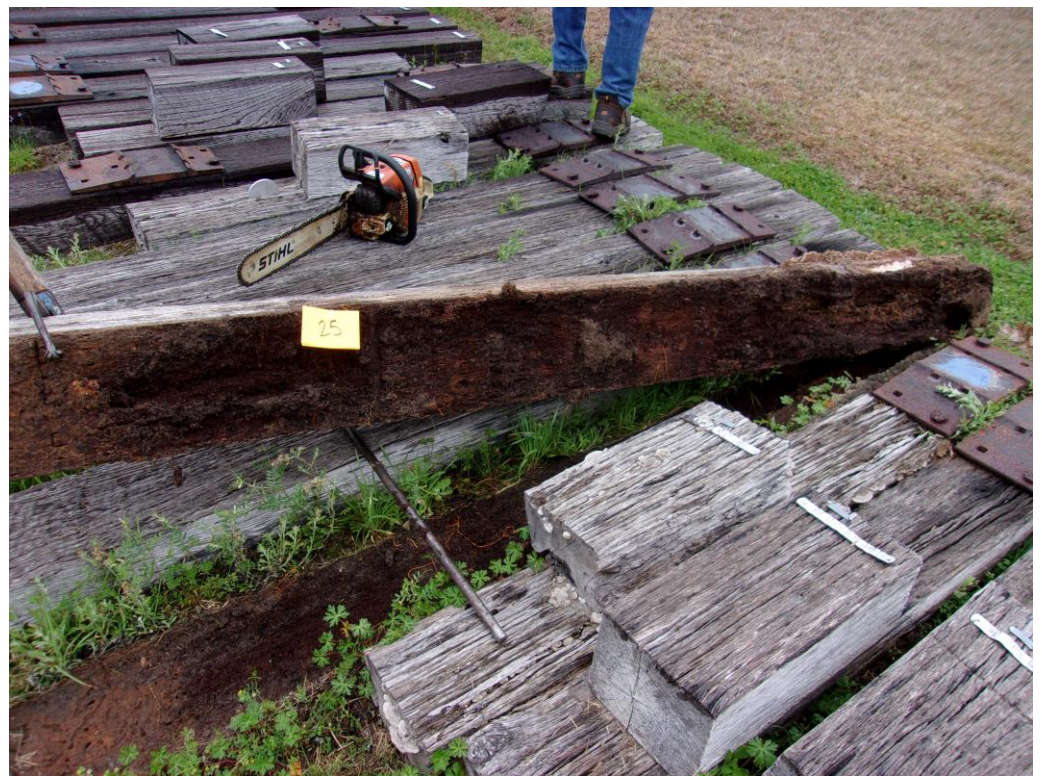
A69 – Tie #25 (Envirosafe/white oak) with decay and live termites.