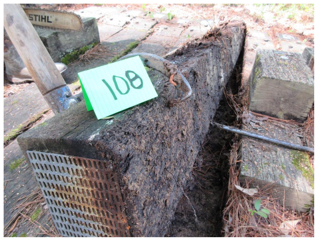
A21 – Tie #108 (Lonza/white oak) with light decay.