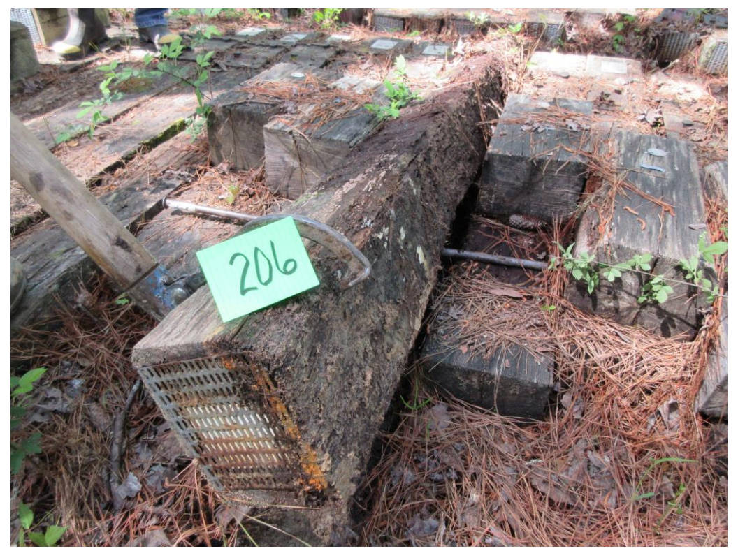
A41 - Tie #206 (Nisus/white oak/borate) with decay on bottom.