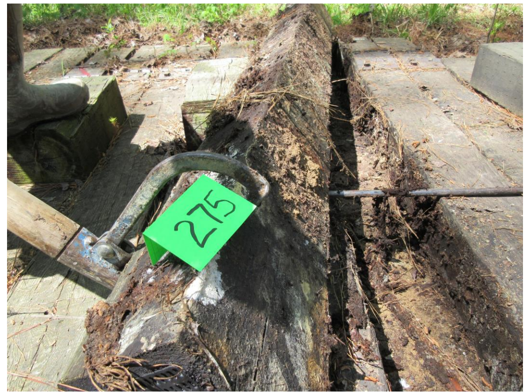
A55 - Tie #275 (Koppers/white oak/P2 creosote).