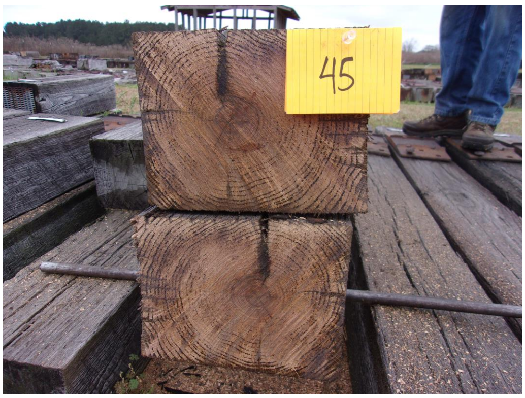
A74 - Tie #45 (Boatright/red oak/borate-creosote 5pcf).