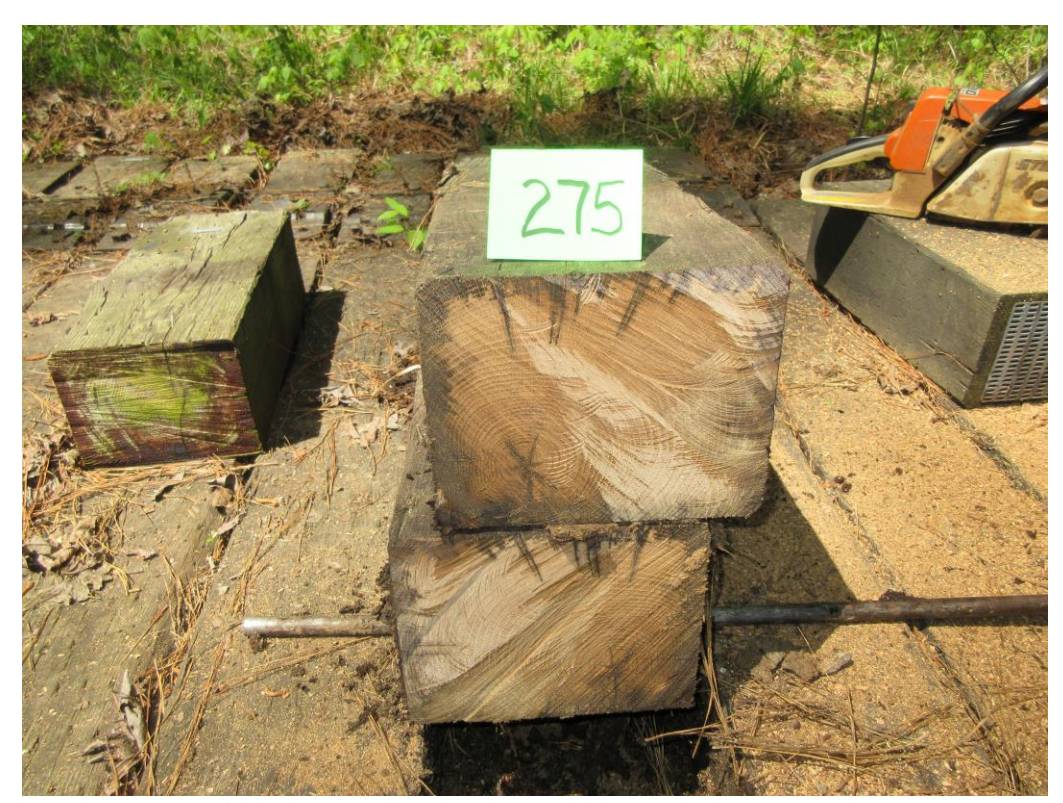
A56 - Tie #275 (Koppers/white oak/P2 creosote).