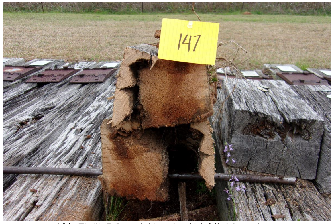
A94 - Tie #147 (Lonza/white oak) which failed due to decay.