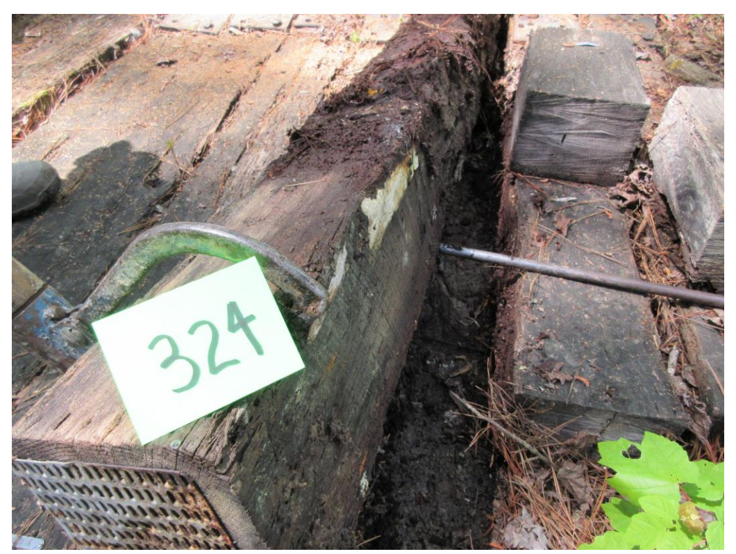
A63 - Tie #324 (Envirosafe/white oak) with decay on bottom.