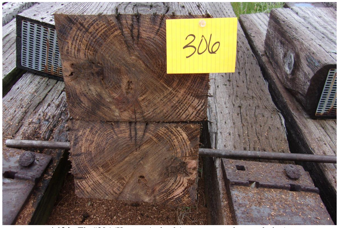
A124 - Tie #306 (Koppers/red oak/creosote petroleum solution).