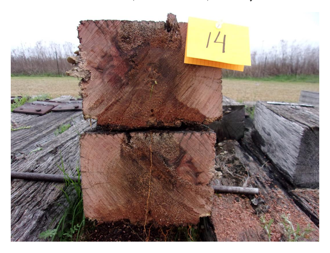
{f A68}-{f Tie} #14 (Envirosafe/red oak) with decay.