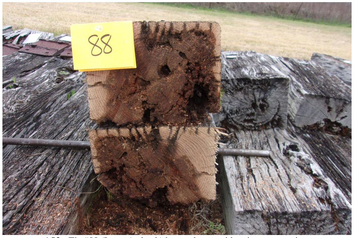
A82 - Tie #88 (Lonza/red oak) heavy decay evident in cross-section.