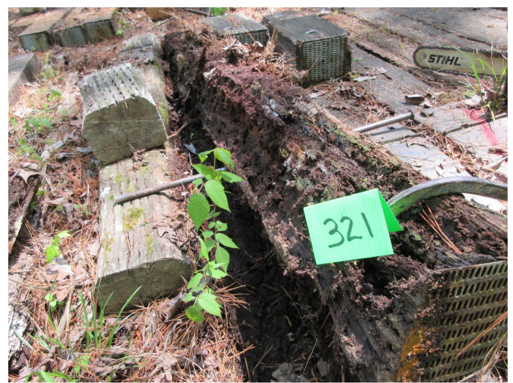
A45 - Tie #321 (untreated/white oak) with extensive decay and moderate termite damage.