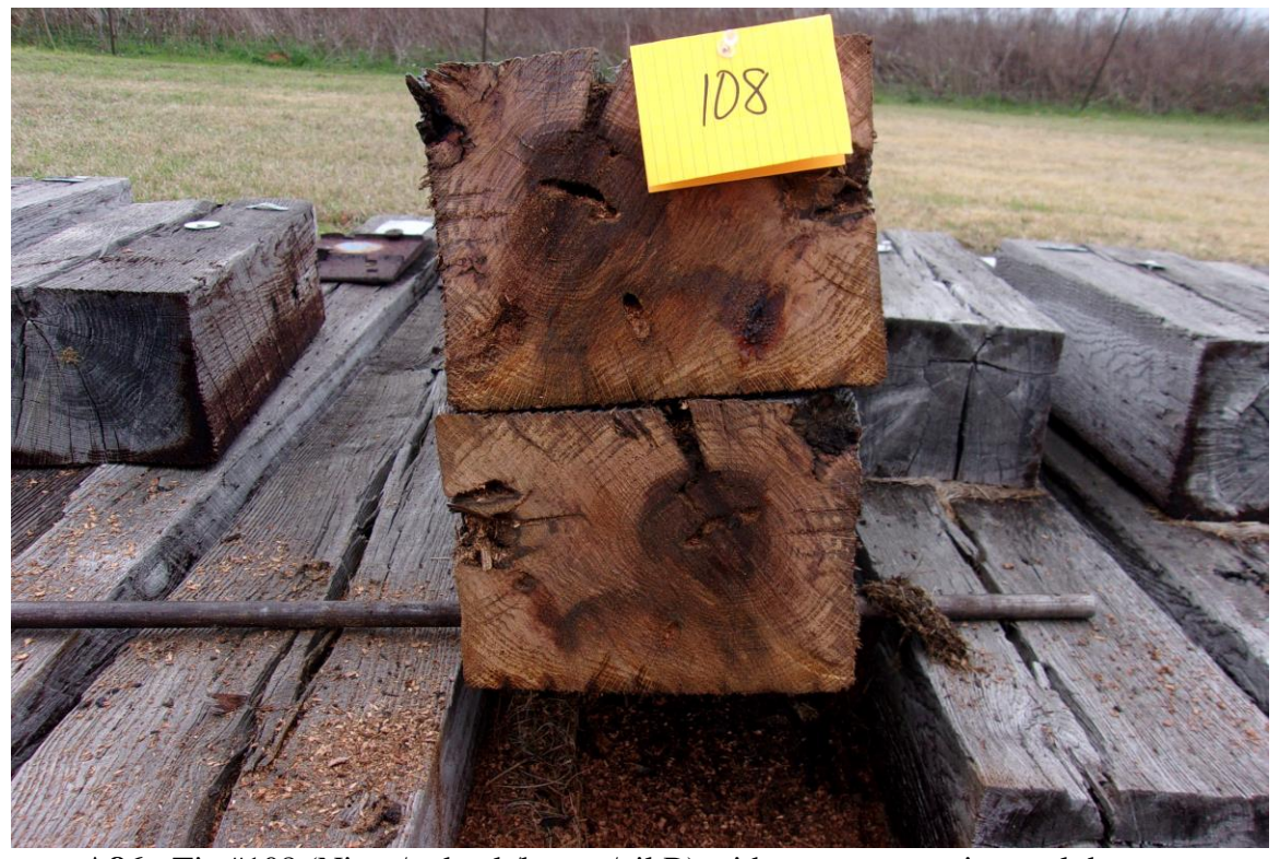
A86 - Tie #108 (Nisus/red oak/borate/oil B) with pretreatment internal damage.