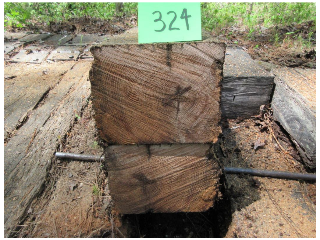
A64 - Tie #324 (Envirosafe/white oak).