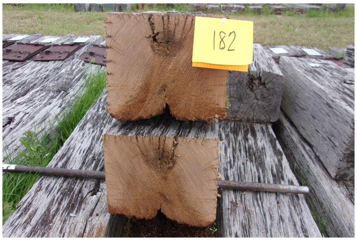
A100 - Tie #182 (Lonza/red oak).