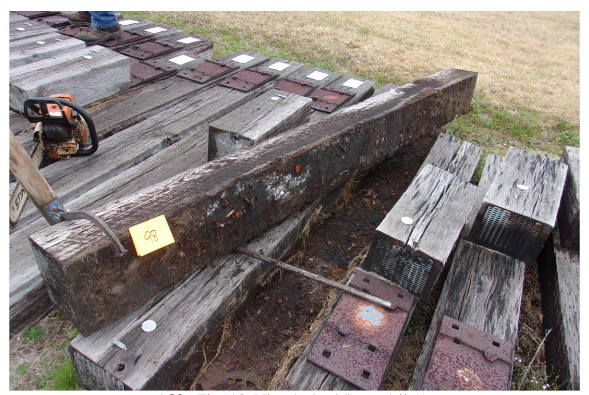
A83 - Tie #98 (Nisus/red oak/borate/oil A).