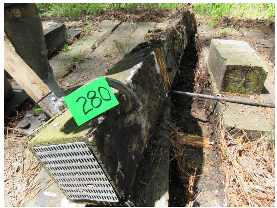
A57 - Tie #280 (Koppers/red oak/P2 creosote).