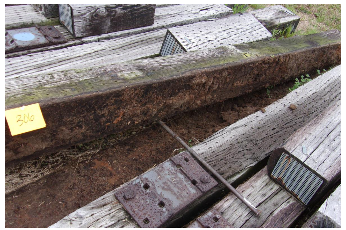
A123 - Tie #306 (Koppers/red oak/creosote petroleum solution).