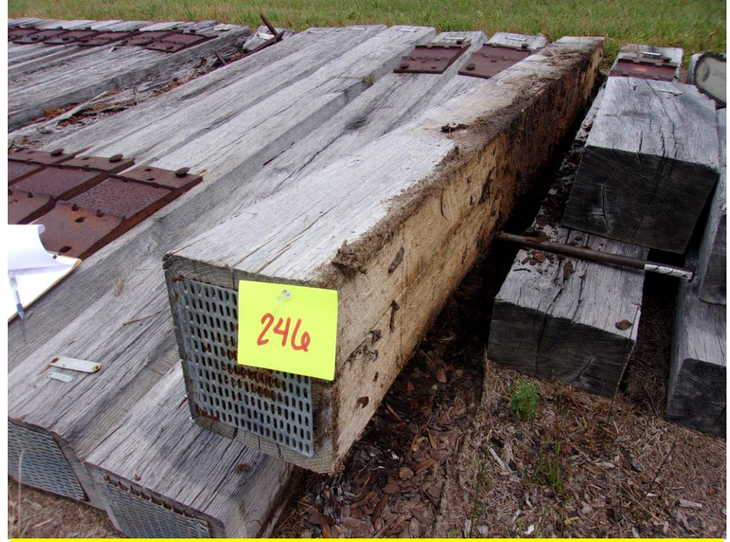
A115 - Tie #246 (Merichem/red oak/borate/CuNap) with trace termite damage.