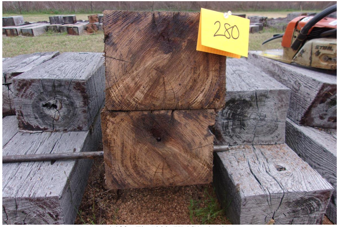
A120 - Tie #280 (KMG/red oak).