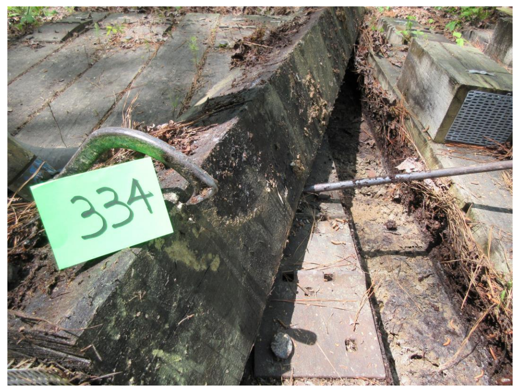
A59 Tie #334 (Merichem/white oak/CuNap).