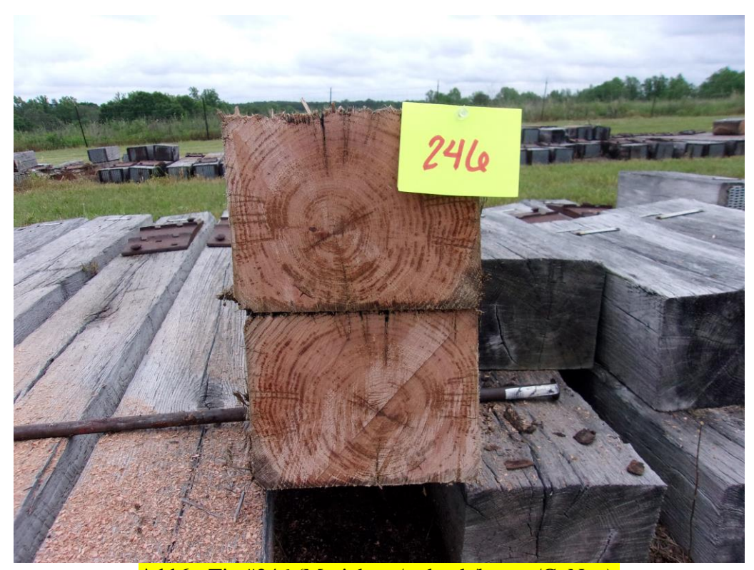
A116 - Tie #246 (Merichem/red oak/borate/CuNap).