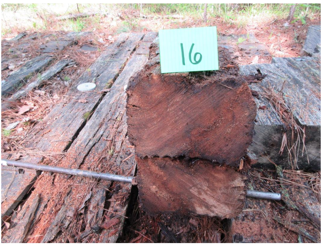
A4 – Tie #16 (Cedarcide/red oak) with decay.