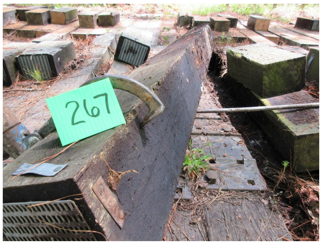
A53 - Tie #267 (Koppers/red oak/creosote petroleum solution).