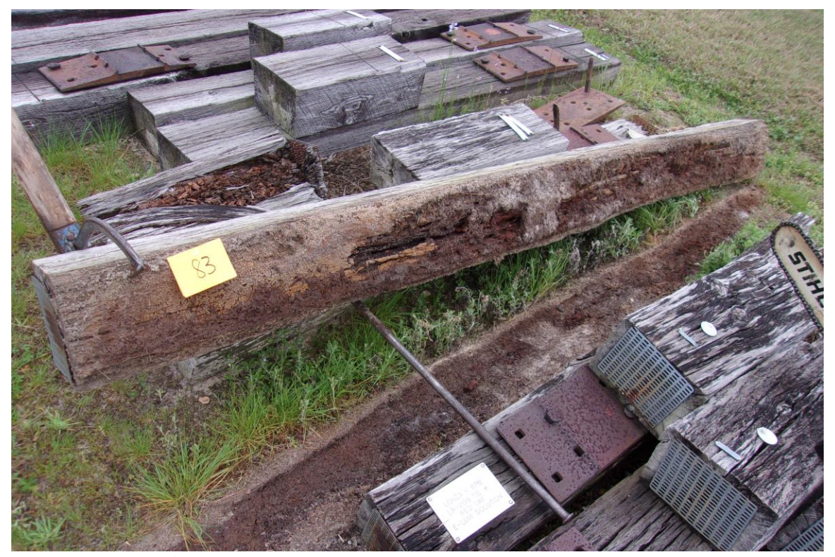
A95 - Tie #83 (untreated/White oak) with heavy decay.