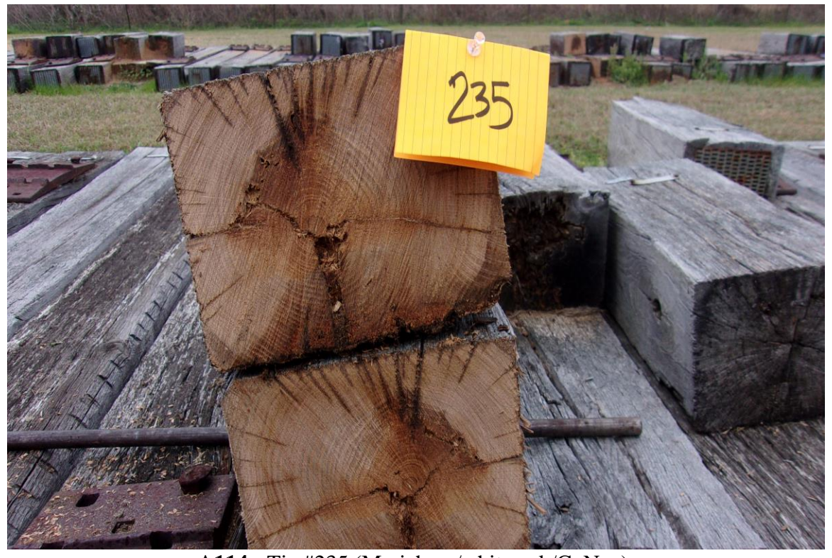
A114 - Tie #235 (Merichem/white oak/CuNap).