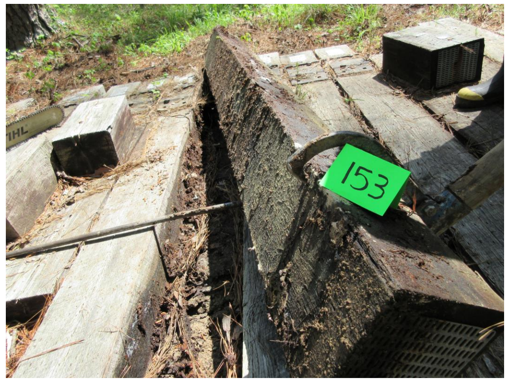
A31 - Tie #153 (Nisus/white oak/borate/oil B).