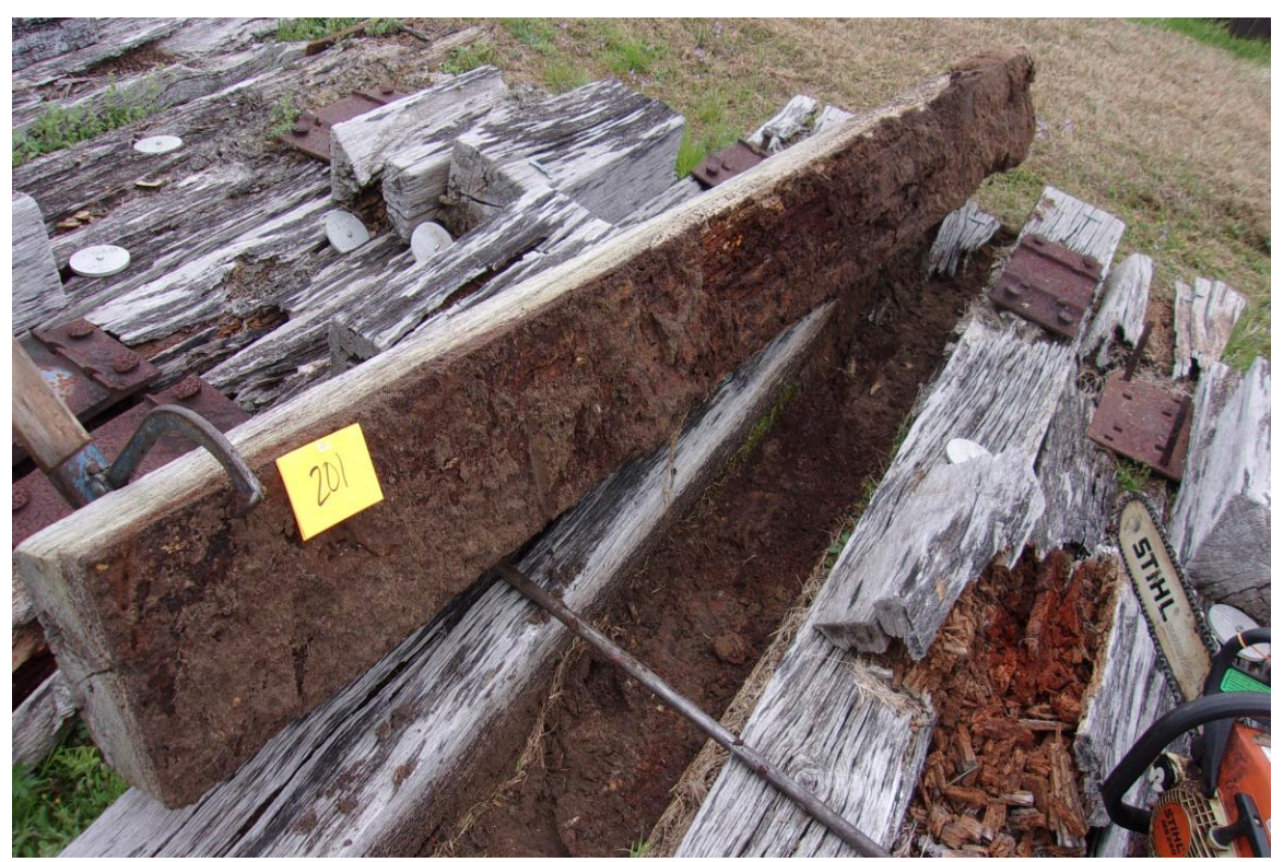
A105 - Tie #201 (Cedarcide/white oak) decay & termite damage.