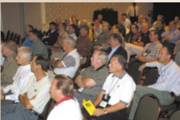
The next morning attendees were up for an early 7:45 a.m. start to business sessions.