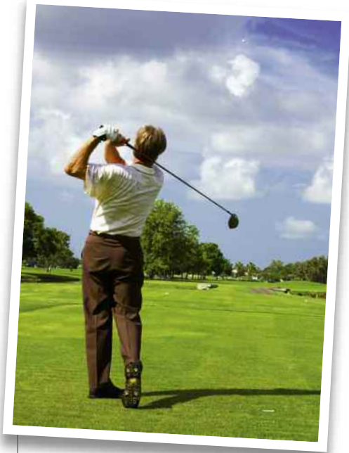
The conference will kick off on Tuesday, Oct. 23, with the annual RTA Golf Tournament at the Emerald Greens Golf Resort and Country Club.

Once the sessions are completed on Wednesday, attendees will be treated to the Annual RTA Banquet and Awards Ceremony. This year's theme is "The Return of Gasparilla, A Pirate Mardi Gras," which will include an interactive