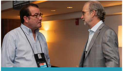
Although the typical in-person networking will move to a virtual format, conference attendees will be able to connect during the conference.