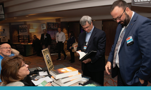
The RTA team is finalizing plans for a virtual exhibit hall showcasing wood tie product vendors.

he Railway Tie Association (RTA) maintains a long-standing tradition of holding an annual conference for its members and stakeholders. Through wars, conflicts and tough economic times we have come together as an association to further our industry with education and valuable opportunities to build your network.