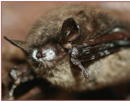
This northern long-eared bat is exhibiting symptoms of the deadly white-nose syndrome disease.

Q: Tell us the latest on the issue of the northern long-eared bat, and what it means to the hardwood industry.