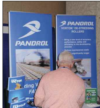
Pandrol also had a tabletop exhibit at NRC.