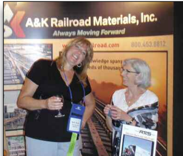
RTA members enjoy meeting with A & K Railroad Materials Inc. reps at their booth.